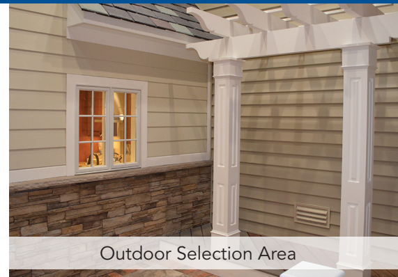
Outdoor Selection Area