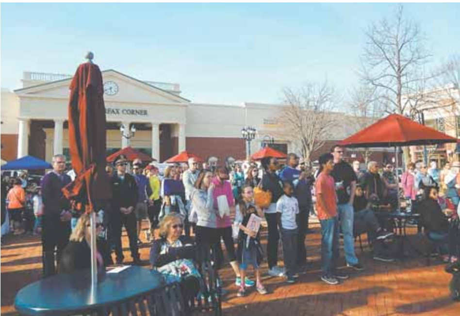
Some of the crowd at the Crime Victims event at Fairfax Corner.