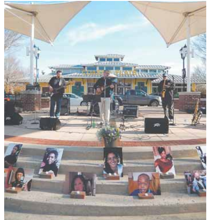
Blue Tango entertains the crowd at the Crime Victims Tribute at Fairfax Corner. In front are photos of local victims.