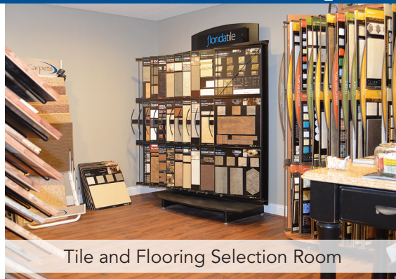
Tile and Flooring Selection Room