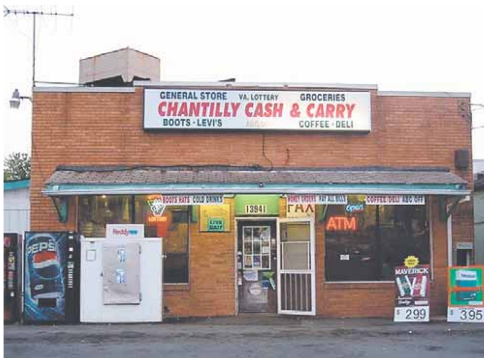
The store was one of Route 50's central general stores, selling cowboy boots, blue jeans, tobacco, handmade sandwiches and more.