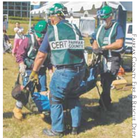
FAIRFAX COUNTY FIRE & RESCUE DEPT

The next available CERT Class is scheduled to begin on Monday, April 24 the Fairfax County Fire and Rescue Academy.