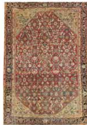
Ziegler Mahal (8.8 x 10.5)