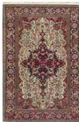
Isfahan Ahmad (4.8 x 7.1)