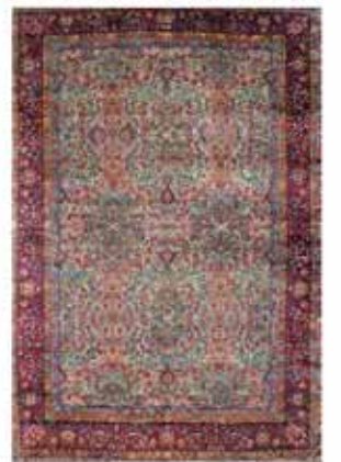
Lavar Kerman (8.10 x 12.1)