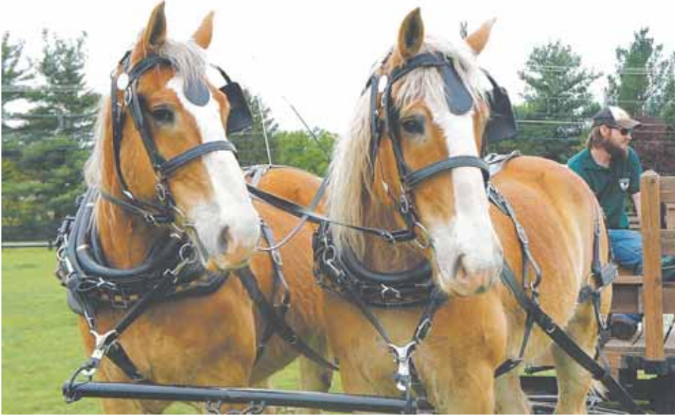
From left, Jeff and Charlie, Frying Pan Farm Park's new Belgian Draft Horse team are listening to the speeches officially welcoming them to the park at a reception in their honor.