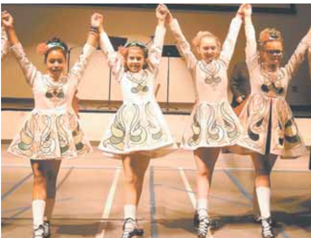
Members of The O'Neill-James School of Irish Dancing.