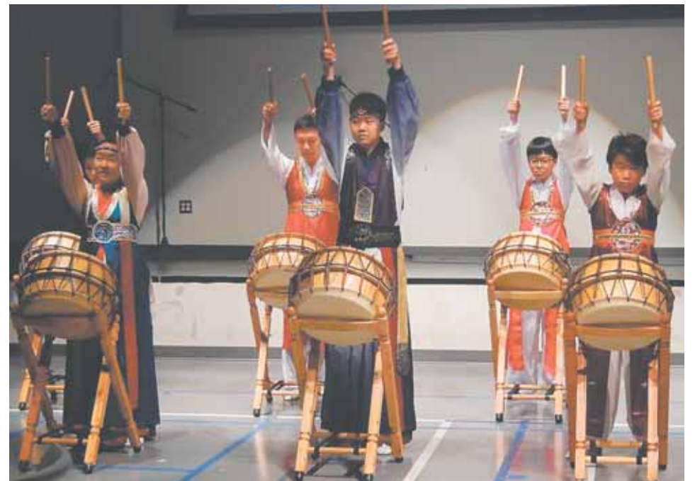
Precision drummers from the JUB Cultural Center.