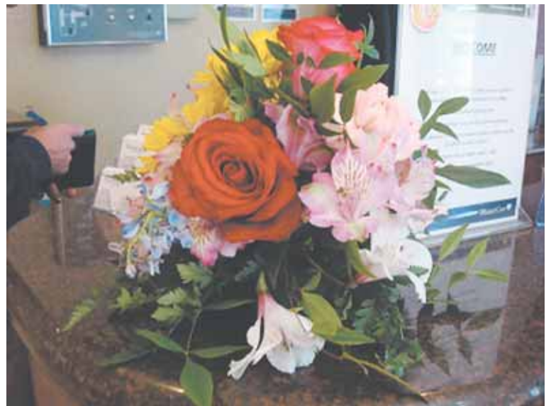
On Saturday, May 6, the Centreville Garden Club will be conducting their annual fundraiser. 9 a.m.-noon in front of Giant Food, 5615 Stone Road, Sully Station, Centreville. This annual fundraiser will help beautify public areas around Centreville. Visit centrevillegardenclub.blogspot.com or email centrevillegardenclub@gmail.com for more.

VE Day Celebration. 1-4 p.m. in Historic Centreville Park, 5714 Mt. Gilead Road. Learn about the many