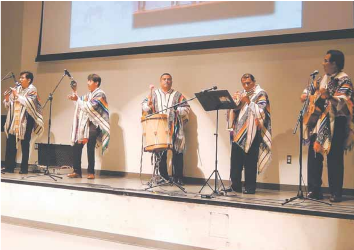
From Peru, Tinkuy Music shares the sounds of the Andes.