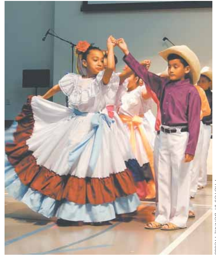
Young dancers from Huellas Hondureñas