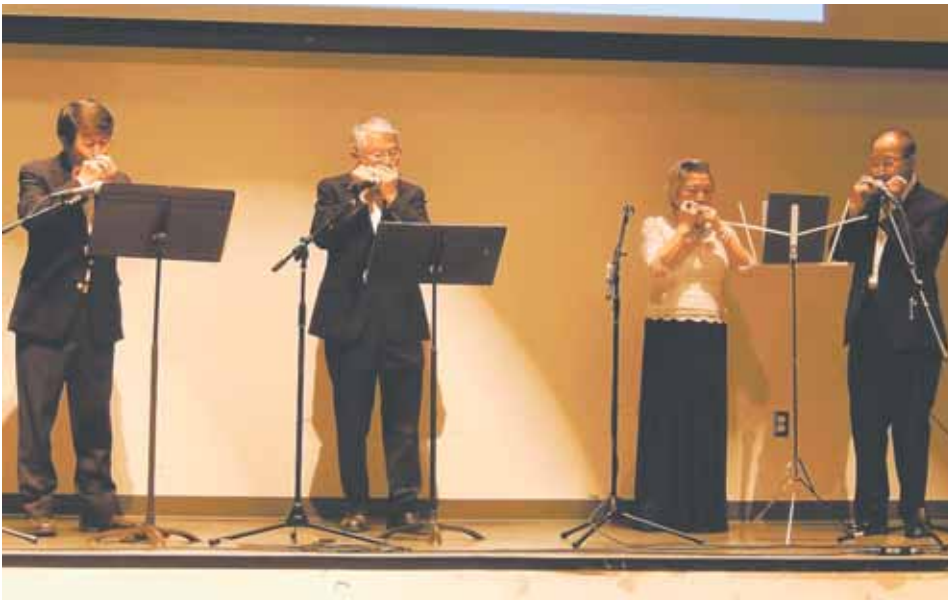
The Washington Area Senior Harmonica Group

The 7 th annual Centreville International Showcase to support the Centreville Labor Resource Center was held April 22 at the Korean Central Presbyterian Church.