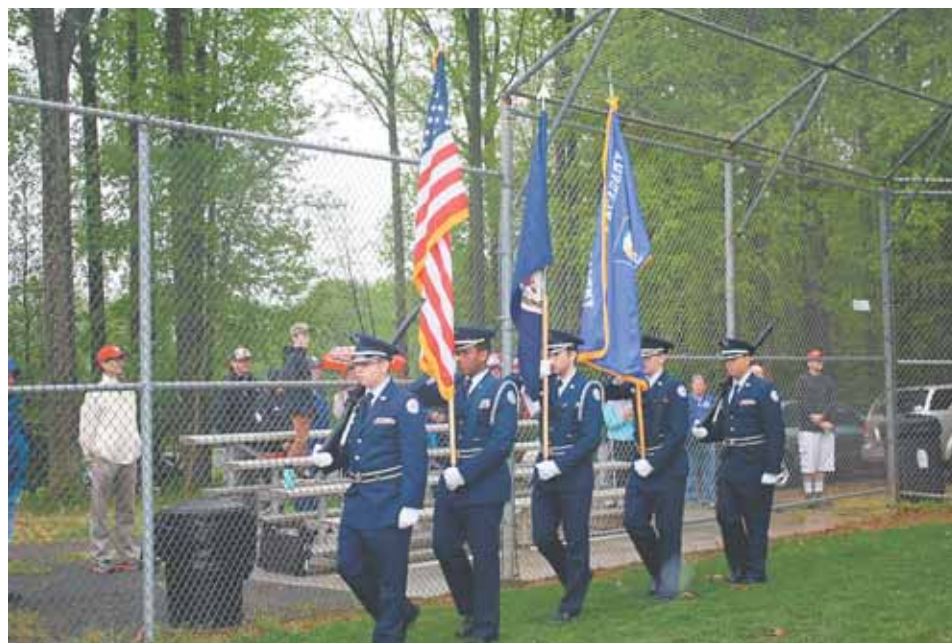
Presentation of American Flag by Chantilly Academy Air Force Junior ROTC Color Guard, Unit VA-20012, at Southwest Youth Association (SYA) Babe Ruth Opening Day Ceremonies.