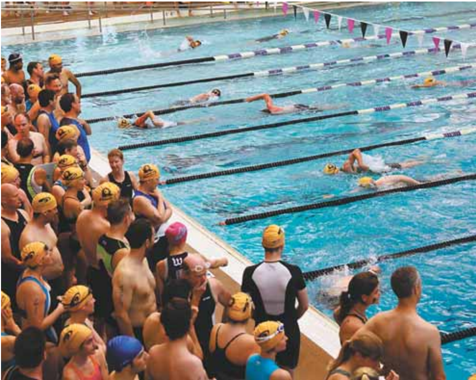
Competitors take to the pool for the first event of the day while others watch while waiting for their turn.