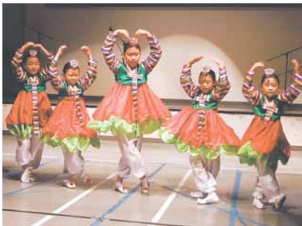
Young Korean dancers from the JUB Cultural Center in Centreville.