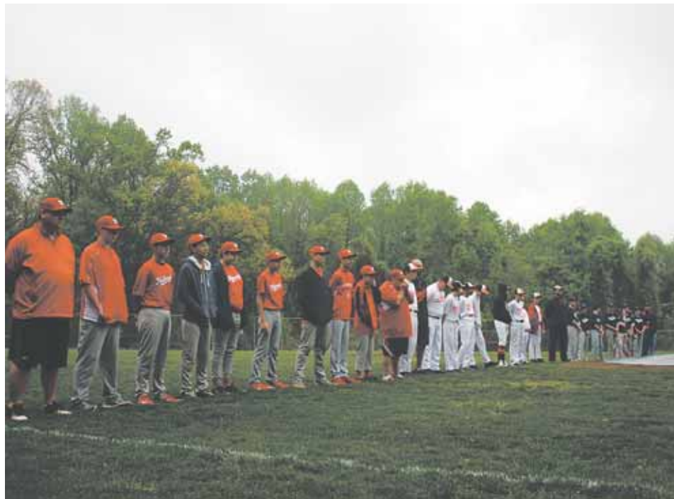
Southwest Youth Association Nationals, Orioles, and Red Sox Line-Up for Opening Day, April 22. The Red Sox won their home opener while other games were postponed due to rain.