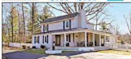
Clifton - $629,000

One-of-a-kind modern farmhouse on beautiful 1.35 acres near historic town of Clifton. Open floor plan, wonderful Kit & Bath updates hardwoods, beautiful Sun Room, and more!