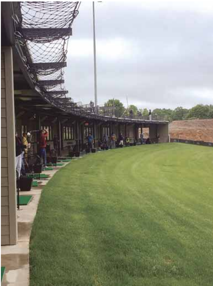
The covered hitting stations allow golfers to hit balls even in inclement weather.