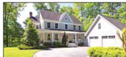
Town of Clifton - $1,125,000

One-of-a-kind modern farmhouse on beautiful 1.35 acres near historic town of Clifton. Open floor plan, wonderful Kit & Bath updates hardwoods, beautiful Sun Room, and more!