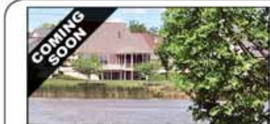
Gainesville - Heritage Hunt 55+

WOW - WATER VIEW! 3 fin lvs., 4BR, 4BA, Grmt Kit with lsnd & SS appls, Liv, Din, Gas Fpl, Sun rm, HDWDS, Loft, Rec, 2 car Gar, irrig syst, Scr porch. Call for information.