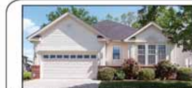
Gainesville Heritage Hunt 55+ $459,900

WOW - WATER VIEW! 3 fin lvs., 4BR, 4BA, Grmt Kit with lsnd & SS appls, Liv, Din, Gas Fpl, Sun rm, HDWDS, Loft, Rec, 2 car Gar, irrig syst, Scr porch. Call for information.