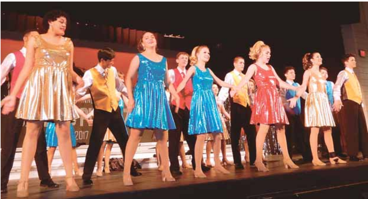
Ready to take a bow after the final number, “Everybody Rejoice.”