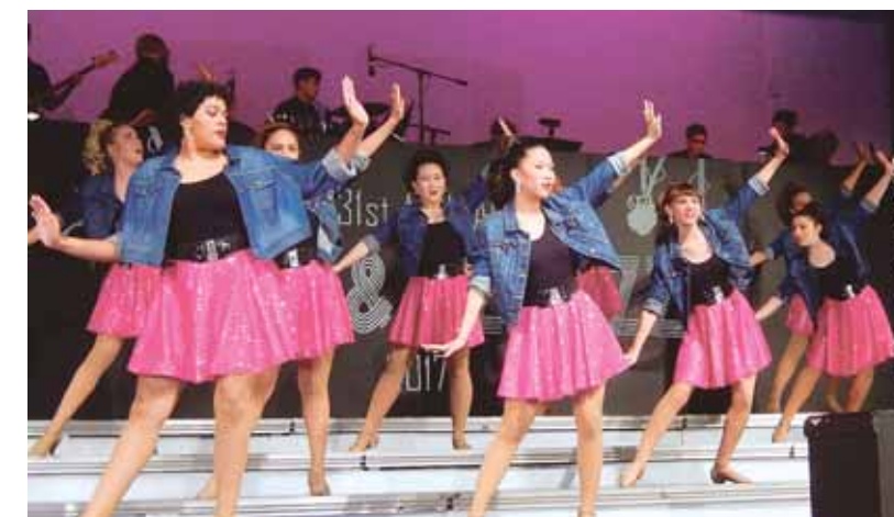
Singing and dancing to "Holding Out for a Hero."