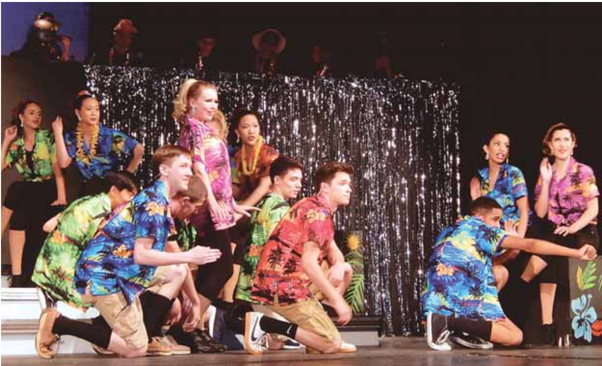
The Beach Boys medley was a big hit with the audience.