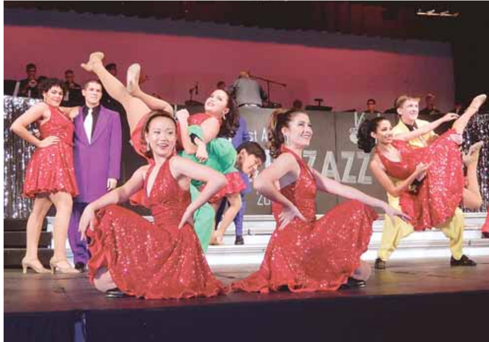
The Chantilly ShowStoppers finishing "Sing, Sing, Sing."