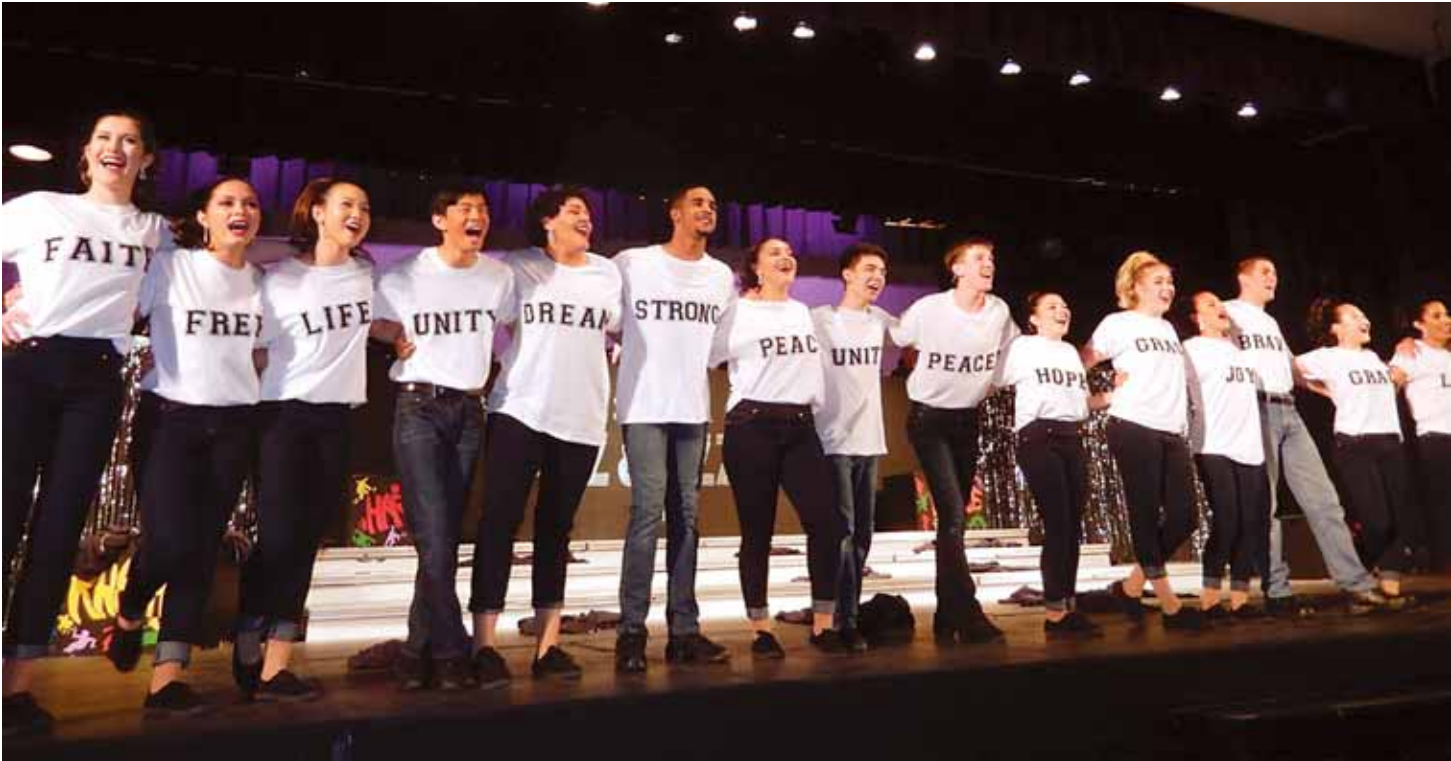
Sending hopeful messages with Michael Jackson’s song, “Black or White.”