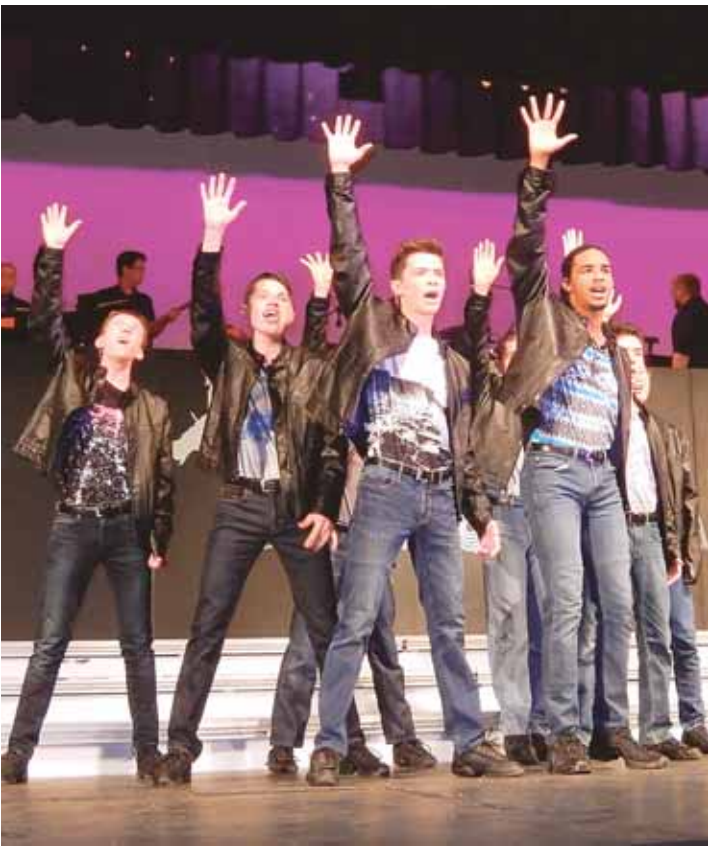
The boys sing, “Born to be Wild.”