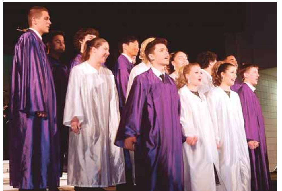
Graduating seniors hold hands and sing "Everyday" together.