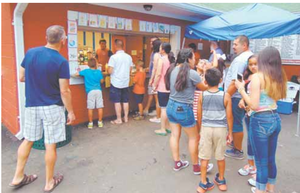
People line up for the Vienna Little League Concession Stand.