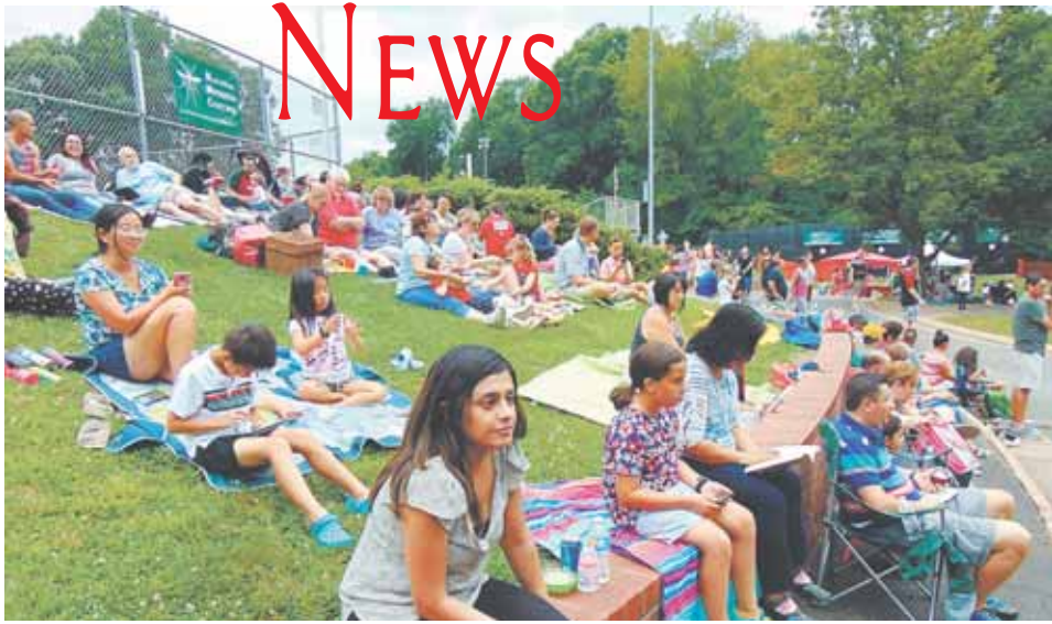
The crowd at Yeonas Park in Vienna waits for the Fourth of July fireworks to begin.