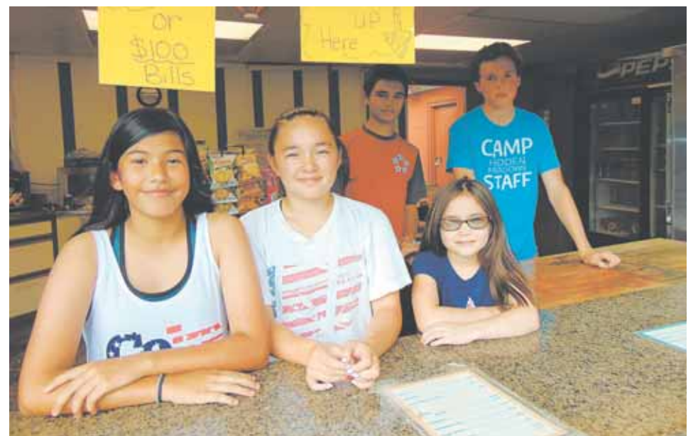
Volunteers at the Vienna Little League Concession Stand.