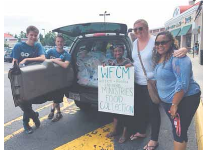
Volunteers helped collect food at past grocery store food drive.

Volunteers are also needed to help with the food collection effort between 9 a.m. – 3 p.m. at the various locations. Duties will include handing out flyers, collecting donations from customers, and weighing, sorting, and organizing food items. Volunteers are also needed between 3 p.m. and 6 p.m. at WFCM's food pantry, located at 4511 Daly Drive, Chantilly, to help accept food donations as they come in from the grocery store locations that will be a part of the community-wide effort. To volunteer, contact Jennie Bush at