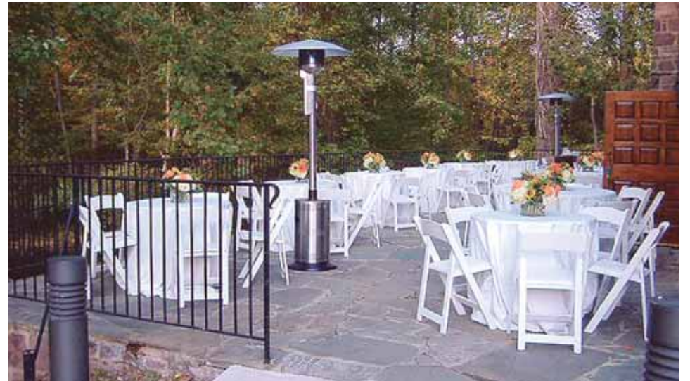
The Cabell's Mill patio.