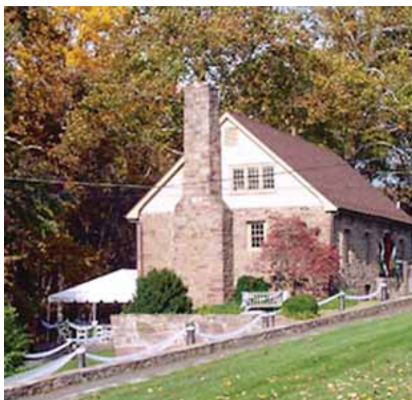
Historic Cabell's Mill is in Ellanor C. Lawrence Park.