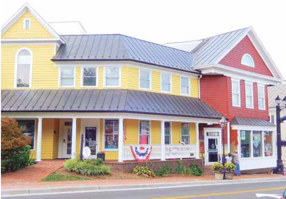
These commercial buildings on Main Street are now bright and colorful.