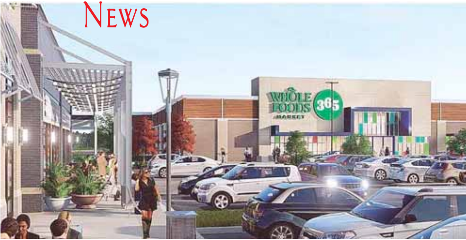
Artist's rendition of the new Whole Foods 365 grocery store.