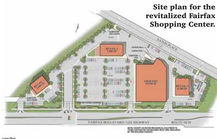
Site plan for the revitalized Fairfax Shopping Center.

Councilwoman Ellie Schmidt called it a "positive project for the City. It would be new and vibrant. The Comprehensive Plan acknowledges that uses should be flexible to market conditions, and I believe the Whole Foods 365 ... would benefit the