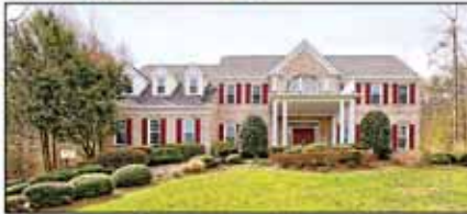
Fairfax Station - $1,075,000

Hermendorfer Associates Top 1% of Agents Nationally