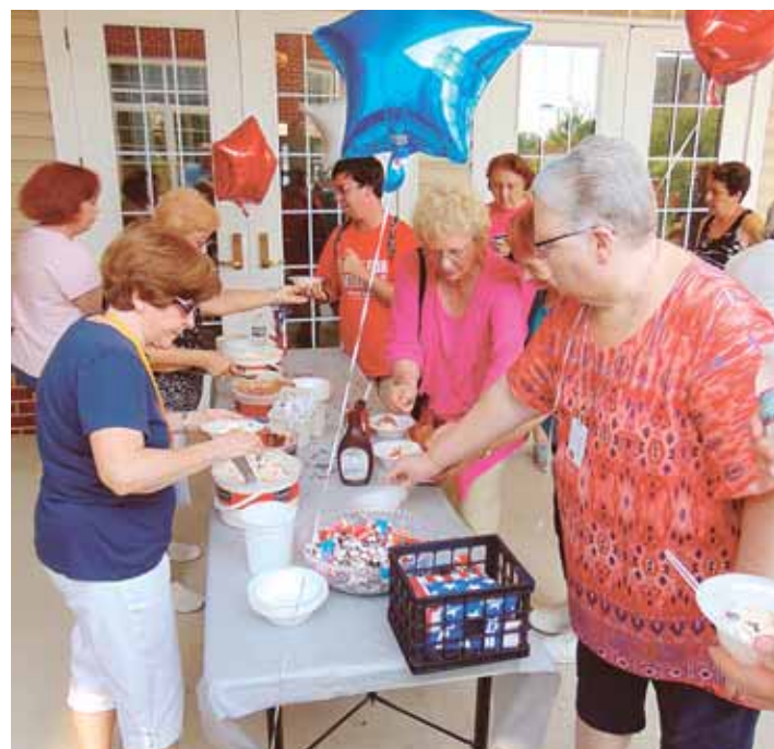
People line up at the Ice Cream Social during National Night Out at the Spring Hill Community, a 55-plus senior community in Lorton, on Tuesday, Aug. 1.