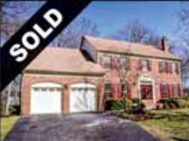
Fairfax Station $719,000 BACKS TO WOODED COMMON GROUND!