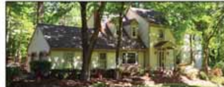
Fairfax Station - $665,000

Beautiful classic colonial with 2-story foyer * Formal living & dining rms * Main level den * Light filled eat-in kitchen with brick cooking alcove, granite, bay window * Spacious family rm w/gas fpl opens to deck * Wood flrs * Master suite features dressing area, large walk-in closets & bath * LL offers rec & game rms, dining area, bdrm, bath, storage rm & walks out to lush back yard * Visit 9424WoodedGlen.com