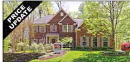
Clifton - $929,000

Find More Information at: www.Hermendorfer.com