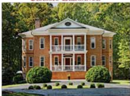
Clifton • 5 acres w/ Pool • $1,175,000