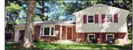
Springfield Price Reduced! $547,900