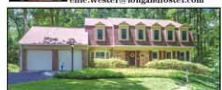
Fairfax Station - $714,000 New on the Market!