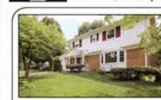
Fairfax $774,900 Beautiful Mantua Hills Colonial with huge Breakfast Room and Family Room