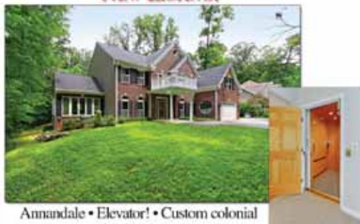
Annandale • Elevator! • Custom colonial $1,150,000