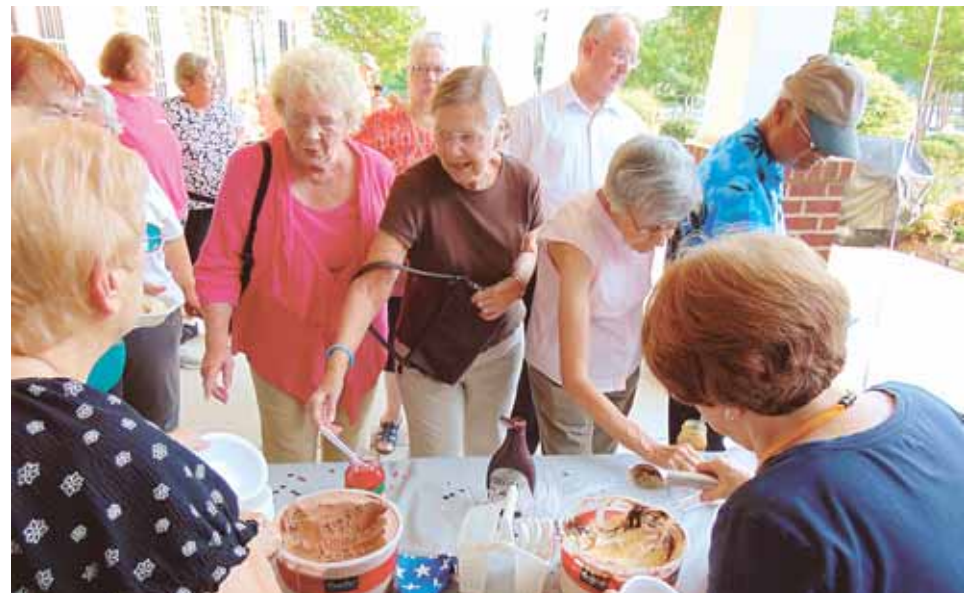
People line up at the Ice Cream Social during National Night Out at the Spring Hill Community, a 55-plus senior community in Lorton, on Tuesday, Aug. 1, 2017.