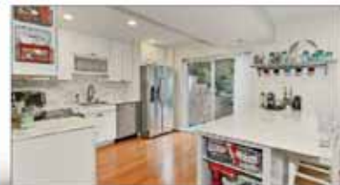
STUNNING REMODEL 10206 Bessmer Lane | Fairfax Kings Park West