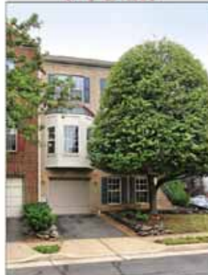
Sterling • $459,900