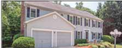
Burke - $750,000

Beautiful classic colonial with 2-story foyer * Formal living & dining rms * Main level den * Light filled eat-in kitchen with brick cooking alcove, granite, bay window * Spacious family rm w/gas fpl opens to deck * Wood flrs * Master suite features dressing area, large walk-in closets & bath * LL offers rec & game rms, dining area, bdrm, bath, storage rm & walks out to lush back yard * Visit 9424WoodedGlen.com