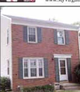
Springfield $410,000 Updated End Unit Sunny 3 BR, 2.5 BA. Updated baths. HW floors on ML. Fresh paint & new carpet on UL & LL. Walk-out from lower level into fenced yard. Close to Kings Glen ES. Terrific location!