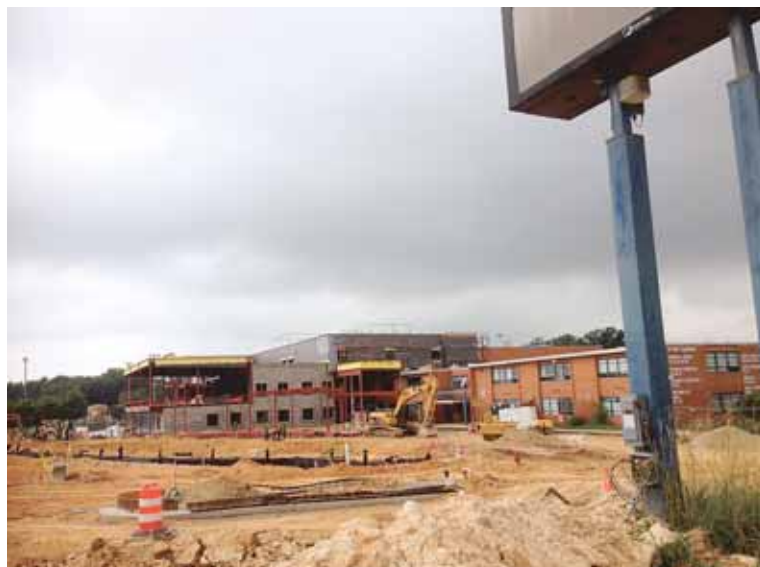
When the renovation is complete in two years, there will be upgrades and an increase in capacity.