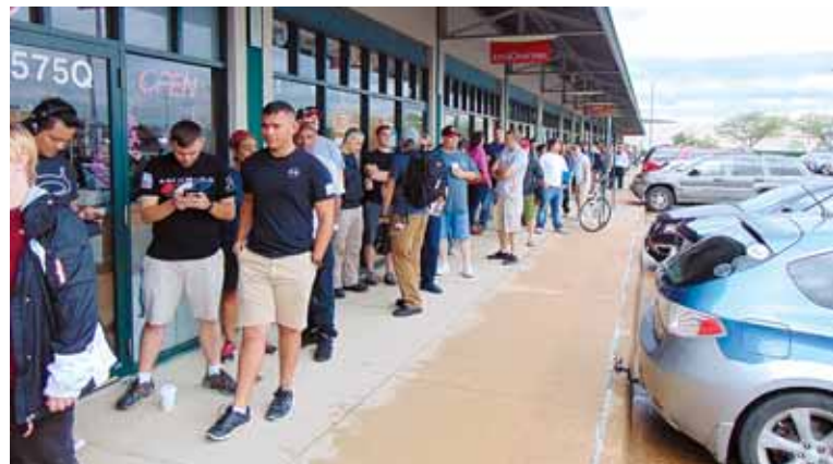
Customers line up to enter the newly opened 5.11 store located on Frontier Drive in Springfield next to Best Buy.