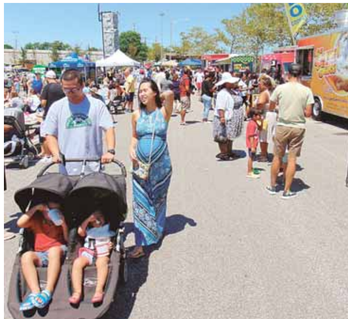
About 3,000 people attended the Taste of Springfield on Sunday, July 30, 2017, outside of Springfield Town Center.