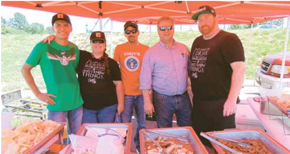
The staff at Chuy's Tex Mex serves up steak and chicken carbon tacos and chips and salsa with creamy jalapenos.