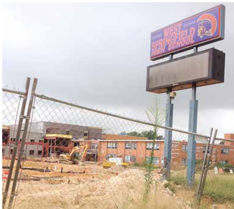
From Rolling Road, the school looks like it's under a complete makeover.

Historically, "Sparta," was a prominent city-state in ancient Greece, a main settlement on the banks of the Eurotas River in Laconia, and around 650 BC, it rose to become the dominant military land-power in ancient Greece, according to Wikipedia. In West Springfield, "Sparta was created – with over 50 classrooms, bathroom facilities with hot and cold