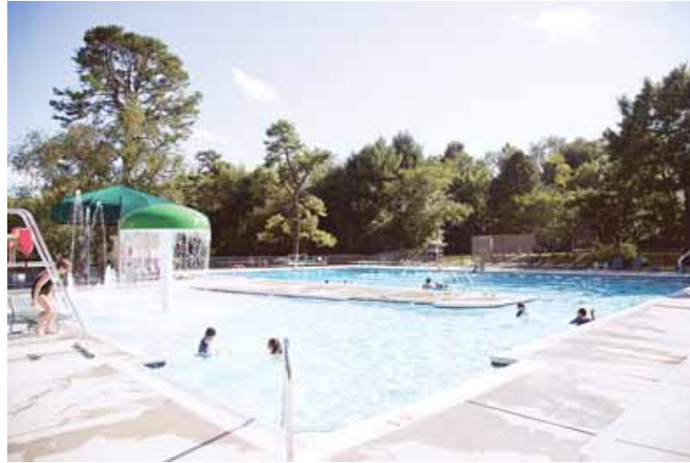
A wide shot of the Burke Centre Ponds Pool in Burke Tuesday, Aug. 8. This pool has zero-foot entrances — a convenience for babies and toddlers to learn how to swim.