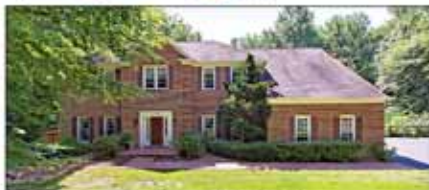
Clifton - $929,000

Hermendorfer Associates Top 1% of Agents Nationally