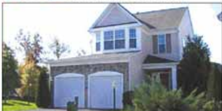
Gainesville - $465,000

Coming Soon! Sought after Virginia Oaks community! 4 BRs, 3.5 Bas, lots of hardwoods, renovated granite & SS kitchen, fenced back yard, cul de sac, move right in!