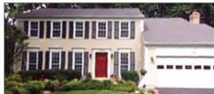
Burke Centre - $649,900

Elegant, welcoming home in great community. Large kitchen opens to family room, spacious bedrooms, terrific walk-out lower level, sparkling pool, spacious deck and so much more!