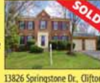
13826 Springstone Dr., Clifton