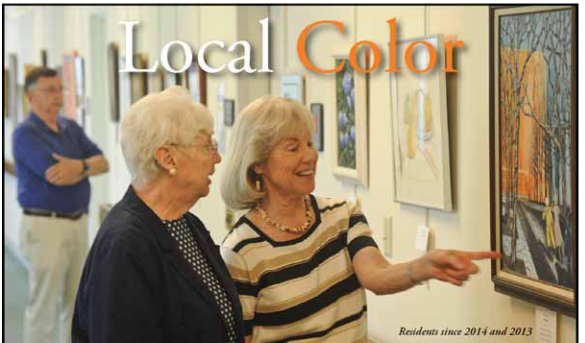
Residents since 2014 and 2013

At Westminster at Lake Ridge, a vibrant and exciting world awaits you. The retirement lifestyle you deserve is shared with the active and engaged friends and neighbors who make our community home, all with peace of mind that comes with on-site health care.