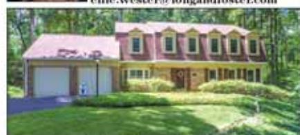
Fairfax Station - $699,000