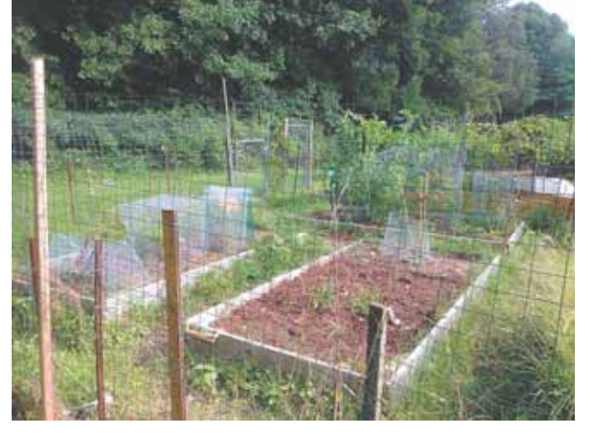
This community garden continues to thrive into late summer.