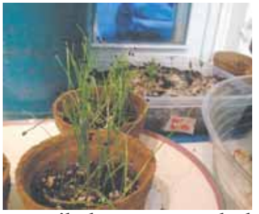
In April, the sprouts soaked up the spring sunshine before being transplanted to the garden in May.