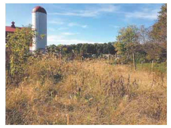
When first taking over Plot 29 at the Grist Mill Park community garden, the weeds ruled.

To get your own garden, go to the Fairfax County website, (www.fairfaxcounty.gov/ parks/greenspring/plots.htm), find a location near your residence and get on the waiting list. Similar to the whole gardening experience, this takes patience as well, and then a certain level of commitment when taking over a plot.