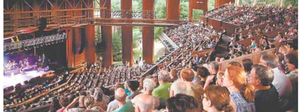
Wolf Trap National Park for the Performing Arts offers performances and musical education year-round.