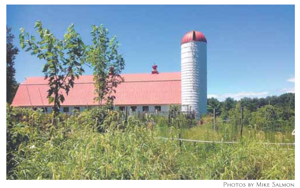
From the community garden at Grist Mill Park in the Mount Vernon area, the barn creates a farming atmosphere.

During the summer, I watched the weather, the holes in the fence, and the