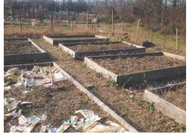
Under the weeds, there were raised beds.

16 VIENNA/OAKTON CONNECTION & NEWCOMERS & COMMUNITY GUIDE 2017-18