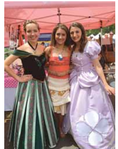
The Singing Princesses of Vienna posed for photos with children and painted little faces at no charge during ViVa! Vienna! 2016.

Easter Fun. Date TBA. 10a.m. Freeman House, 131 Church St. S. Enjoy a visit with the Easter Bunny and a spring craft. Activities are for children 12 and younger. Call 703-938- 5187 or visit www.viennava.gov.