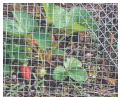
The strawberries were the first to be caged for varmint protection, and the first to be eaten.