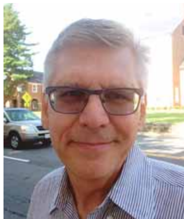
COMPILED BY MIKE SALMON

"Get out and walk the city, great paths, you see a lot and learn a lot."