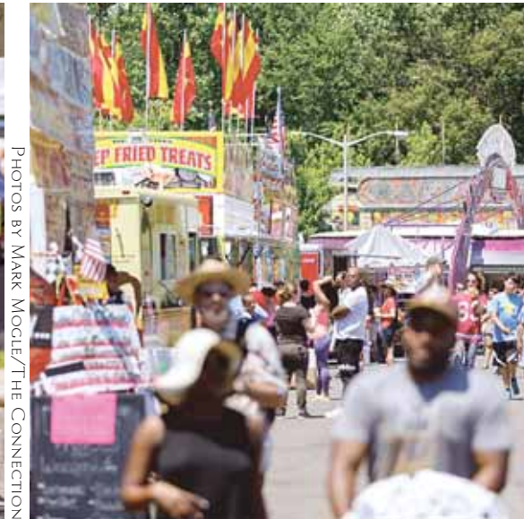
Thousands turned out for the Celebrate Fairfax Festival in early June.

Northern Virginia. Events include badminton, volleyball, bocce, miniature golf, and many more. The basic registration fee is $13. A fee of $1 is required for each event. Additional fees may apply. Visit nvso.us/ .