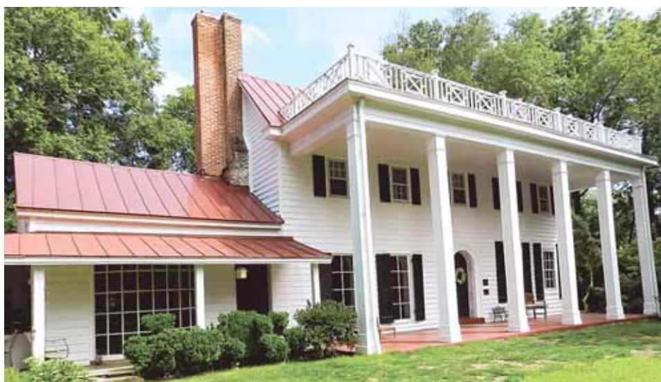
Oak Hill Mansion, built in 1790, opens four times a year for the public to explore.