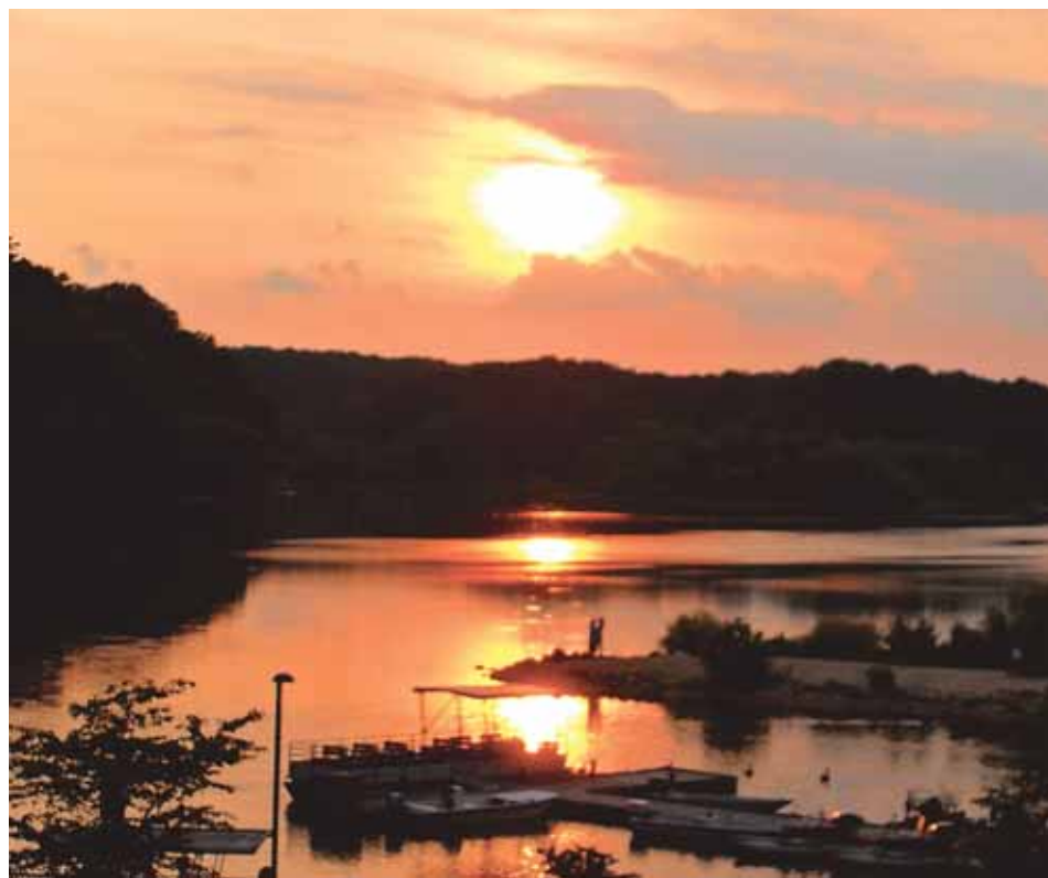
Lake Accotink Park is a perfect place to enjoy the natural beauty of Fairfax.

HISTORY BUFFS will love visiting the historic Oak Hill Mansion and Wakefield Chapel. The Oak Hill Mansion in