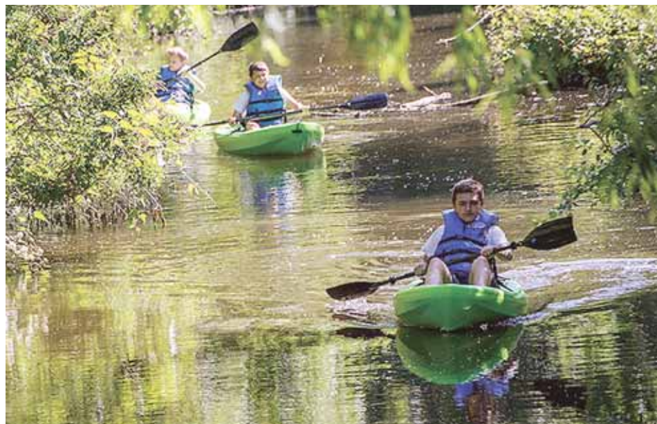
Kayakers at Lake Accotink.