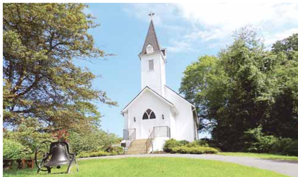
Historic Wakefield Chapel is maintained by the Fairfax County Parks Authority and is available to the public for rentals.