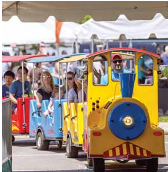
Amusement rides were popular at the Celebrate Fairfax Festival.

Photo Exhibition. 9 a.m.-5 p.m. at Fairfax Museum and Visitor Center, 10209 Main St., Fairfax. "Over There: Americans in World War I" a traveling exhibition from the National Archives and Records