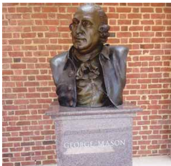
At Gunston Hall in the Mason Neck portion of Lorton, a majority of the historical exhibits feature George Mason.

These pictures and information are a part of the traveling exhibition from the National Archives, Amending America: The Bill of Rights, commemorating the 225th anniversary of the ratification of this landmark document. According to information on their website, “Amending America: The Bill of Rights,” spotlights an important period in American history, looking at the first ten amendments to the U.S. Constitution, known as the Bill of Rights, and illustrates how each amendment protects U.S. citizens. Featuring facsimile documents, reproduction artifacts, and interactives, Amending America invites visitors to connect directly with the people, places, and events that mark this historic document’s evolu-