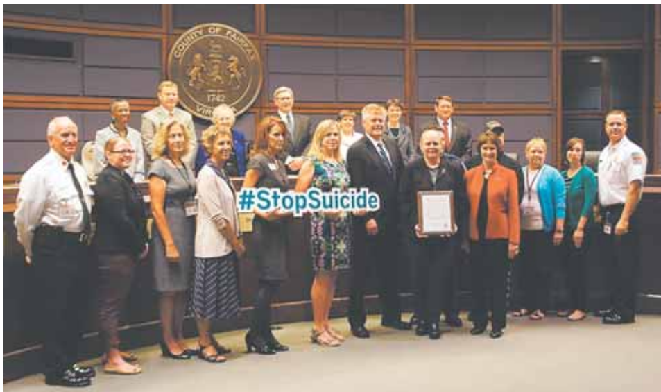
The Fairfax County Board of Supervisors presented a proclamation to declare September as Suicide Awareness and Prevention Month.