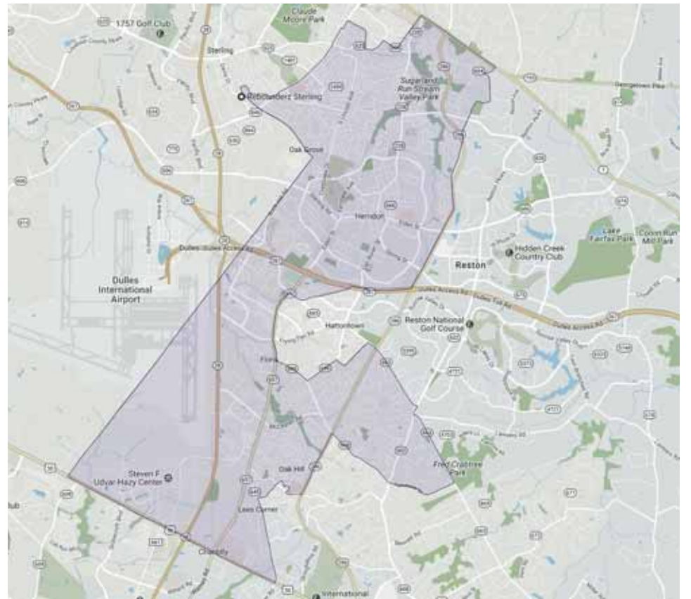
The 86th House District stretches from Chantilly through Oak Hill into Herndon and Sterling.