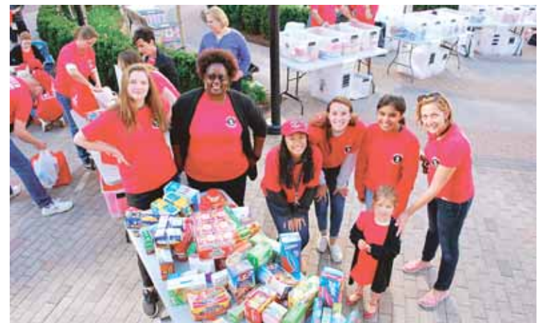
Volunteers of all ages came to help Food For Neighbors kick off a second year of combating teen hunger.

times per year. Volunteers organized by neighborhoods then collect the food and bring it to a central location, where it is sorted and then delivered to participating schools. At the schools, volunteers package the food, and social workers and parent liaisons distribute the packages to students on a weekly basis. The successful and ever-growing program now serves students at Herndon Middle