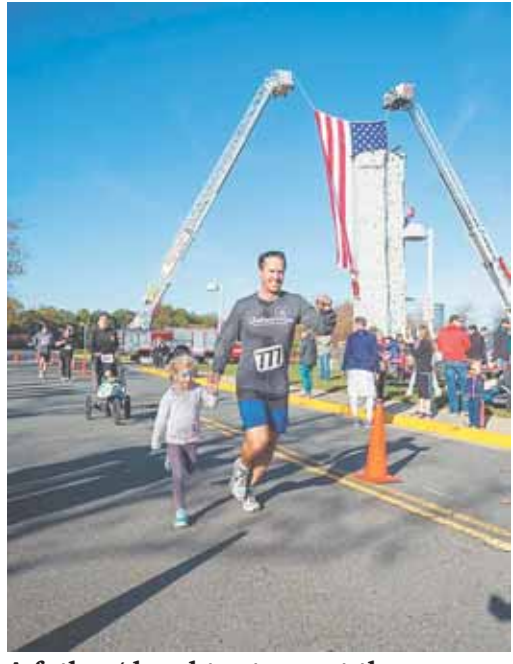
A father/daughter team at the Shelane's Fun Run finish line in 2016.

THE RACE MONEY raised will help support the nonprofit Postpartum Support Vir-