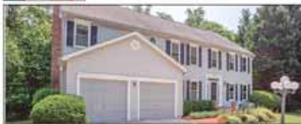
Burke - $750,000

Beautiful classic colonial with 2-story foyer * Formal living & dining rms * Main level den * Light filled eat-in kitchen with brick cooking alcove, granite, bay window * Spacious family rm w/gas fpl opens to deck * Wood flrs * Master suite features dressing area, large walk-in closets & bath * LL offers rec & game rms, dining area, bdrm, bath, storage rm & walks out to lush back yard * Visit 9424WoodedGlen.com