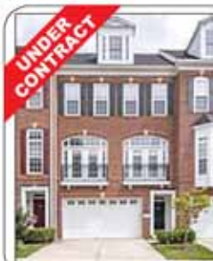
Fairfax City $674,900

3 BR, 3.5 Baths townhouse with 9' ceilings, plenty of windows and gleaming hardwoods. Gourmet Kitchen. Walking to GMU and Fairfax City downtown, Great Location and Schools!