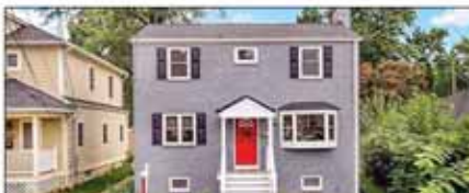
Arlington - $639,000

Beautiful classic colonial with 2-story foyer * Formal living & dining rms * Main level den * Light filled eat-in kitchen with brick cooking alcove, granite, bay window * Spacious family rm w/gas fpl opens to deck * Wood flrs * Master suite features dressing area, large walk-in closets & bath * LL offers rec & game rms, dining area, bdrm, bath, storage rm & walks out to lush back yard * Visit 9424WoodedGlen.com