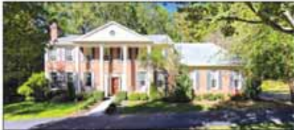
Fairfax Station - $899,950

Hermendorfer Associates Top 1% of Agents Nationally