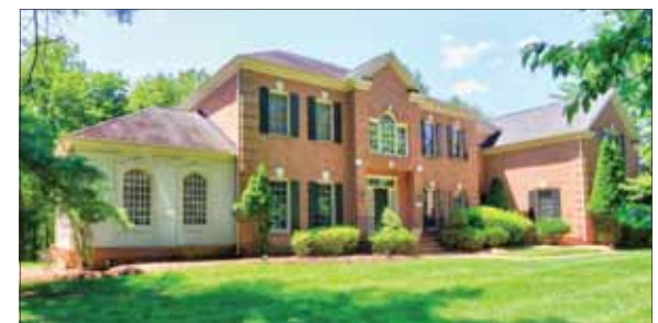
Great Falls $1,499,000 9,000 SF 4-sided brick. 1.8 acre wooded private lot