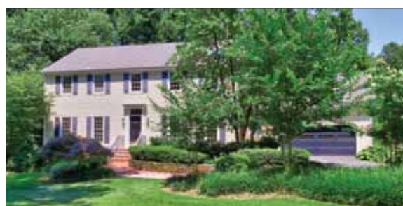
Great Falls $989,000 Serene setting with a pool. Open gourmet kitchen to family room