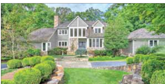
Great Falls $1,249,000 Bright, open floorplan. Luxury Main level master suite