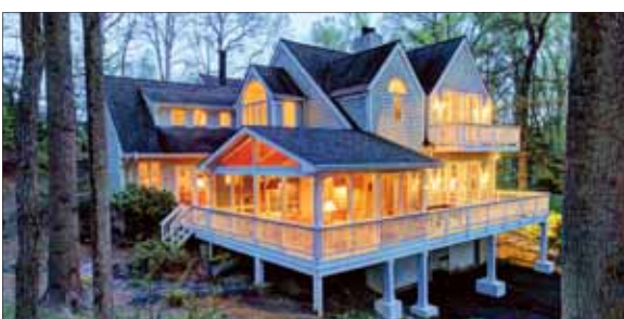
Great Falls $1,099,000 Light, airy floorplan opens to multiple decks and screened porch