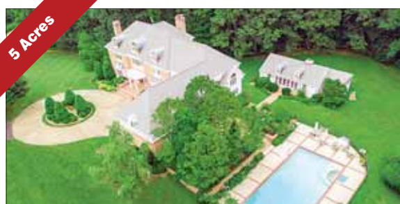
Great Falls $1,999,000 Multi generational compound. Highly motivated sellers