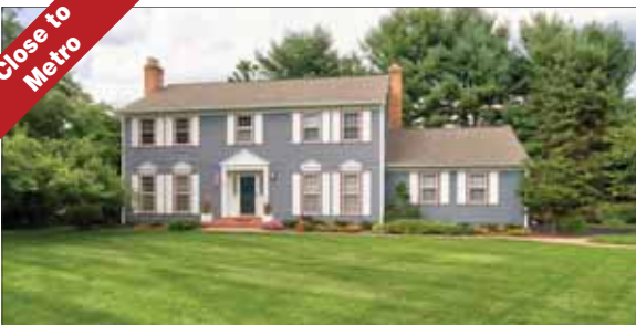
Great Falls $1,085,000 Phenomenal location! Beautiful kitchen and updated master bathroom

High-quality build that is spacious and in impeccable condition. 10 ft.+ ceilings on the main and lower level. Open, flowing floorplan with designer finishes and incredible attention to detail. The master bedroom has a series of walk-in closets and laundry room. Four additional, generously-sized bedroom suites with private bathrooms are on the upper level. There is an abundance of storage and a 4-car garage. Private 5 acre setting.