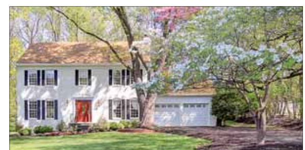
Great Falls $1,024,000 Convenient to everything in town! Thoroughly updated