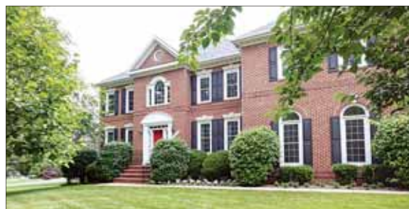
Reston $1,100,000 Nicely updated with a level backyard. Langley pyramid!