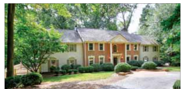
Great Falls $1,575,000 One-of-a-kind lake and pool views. Upscale, elegant floorplan