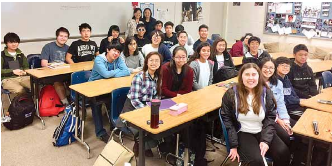
The students experienced an hour-long interactive conversation, practicing their Korean speaking and listening skills.