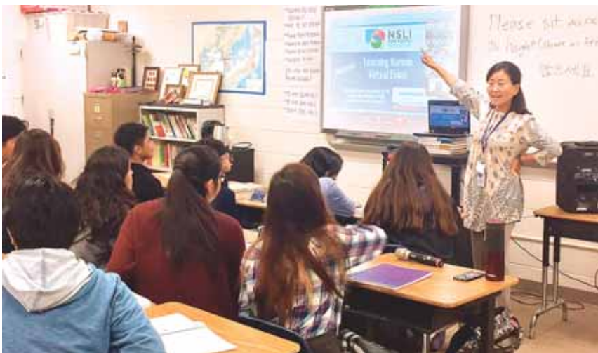
Technology brought together students from Fairfax Academy's Korean class in FCPS, Hylton High School's Korean class in PWCS, and students on scholarship studying abroad in various locations in Seoul.

Advice from the students abroad ranged from explaining the challenges and rewards of the program, while also just comparing and contrasting the typical school day and social/family life for them as students in Korea. They explained they have gradually spoken less English each day and truly immersed themselves in Korean culture, while making lifelong friends. Those same students also gave advice to our students regarding how this experience helps to "recognize and contain your fear" when learning to communicate in a language that is not your native language.