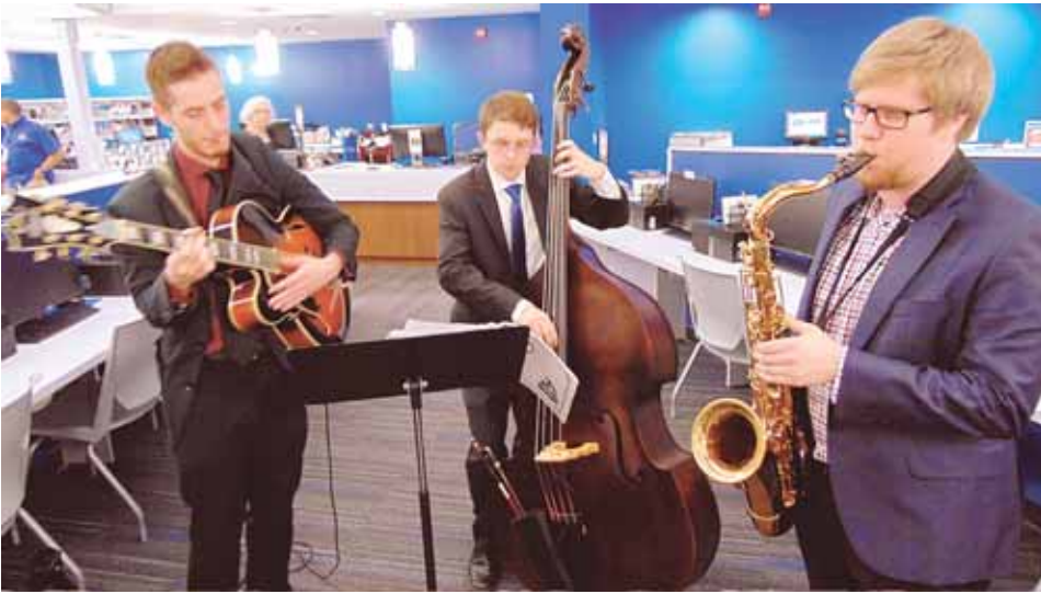
George Mason University students from Mason Music Productions perform at the Library Jubilee.