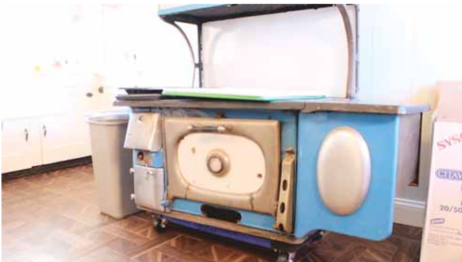
Grandma's stove, still functional, bought from Montgomery Ward.

Sunrise's new senior living community, located behind the historic home, is set to be completed early next year.