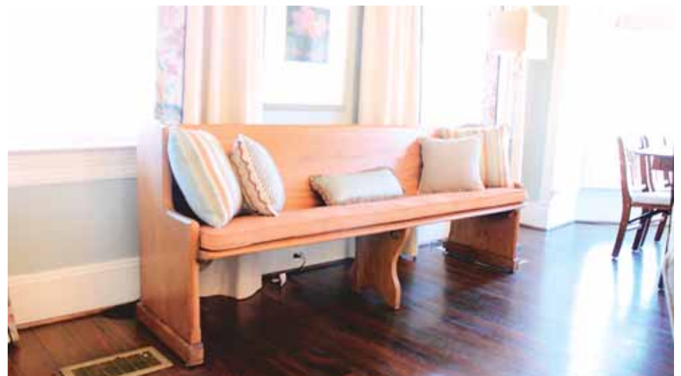
Simpson's pew bench made in the late 1940s, from the Burke Church.