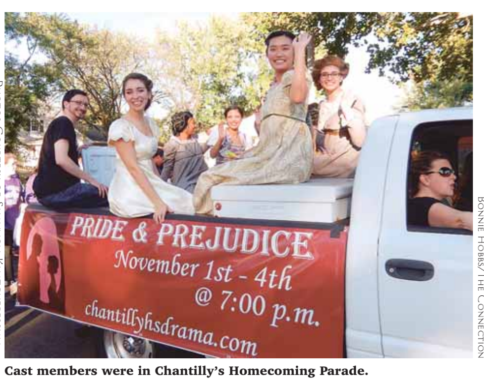
Cast members were in Chantilly's Homecoming Parade.