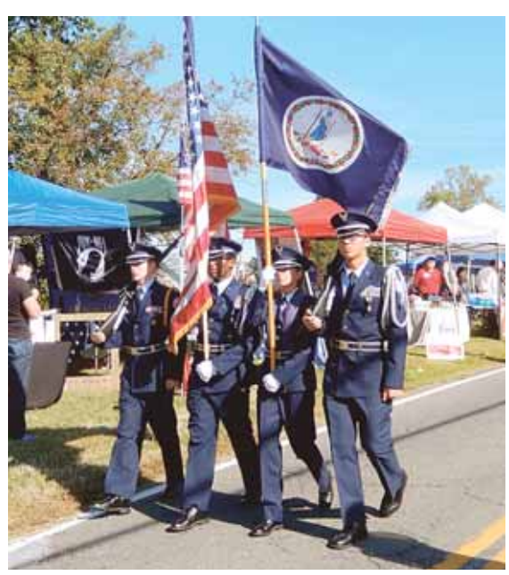
The Chantilly Academy's Air Force JROTC leads the parade.