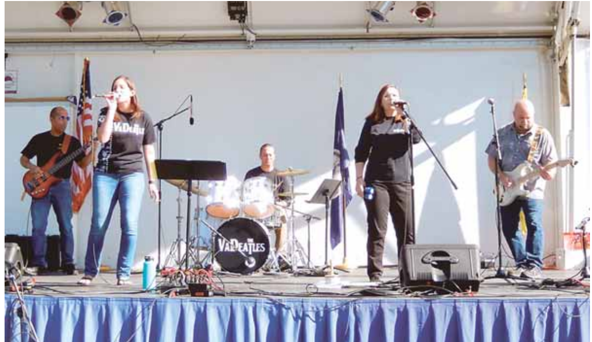
Stone Middle School teachers perform rock music as the VaDeatles.