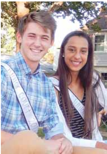
Members of the Junior Court.

Chantilly High's Homecoming Parade was Friday, Oct. 20, in Greenbriar. MORE PHOTOS, PAGE 8.