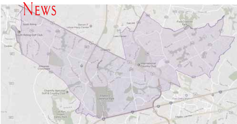
The 67th District stretches from South Riding through Sully Station and Penderwood.