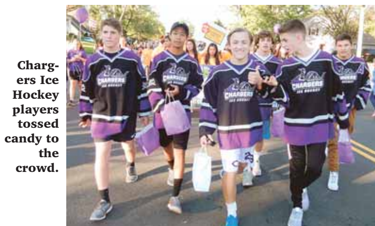
Chargers Ice Hockey players tossed candy to the crowd.