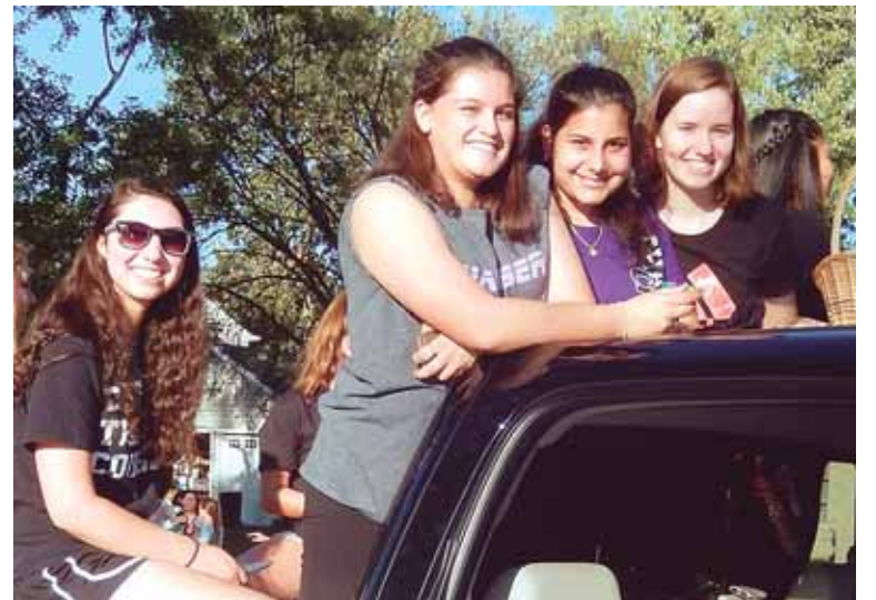
Some members of the Chantilly ShowStoppers choral group.