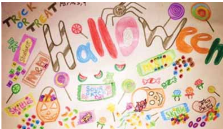
Illustration by Parmis Salahy, age 9, Chantilly