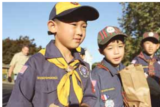
Members of Cub Scout Pack 1459