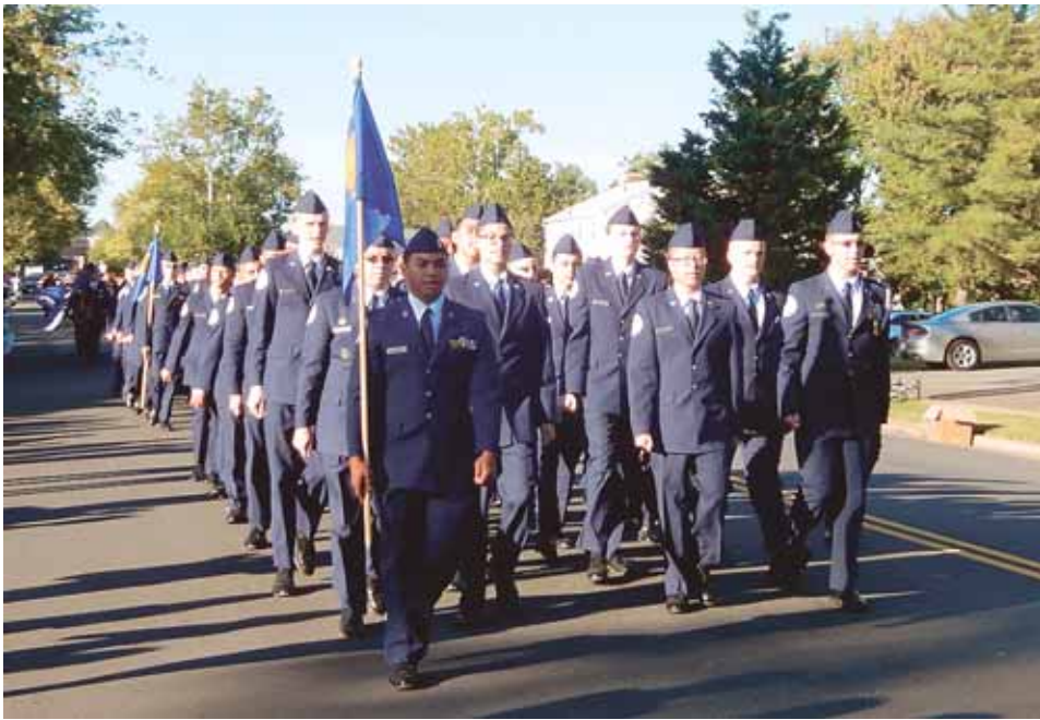
The Chantilly Academy's Air Force JROTC