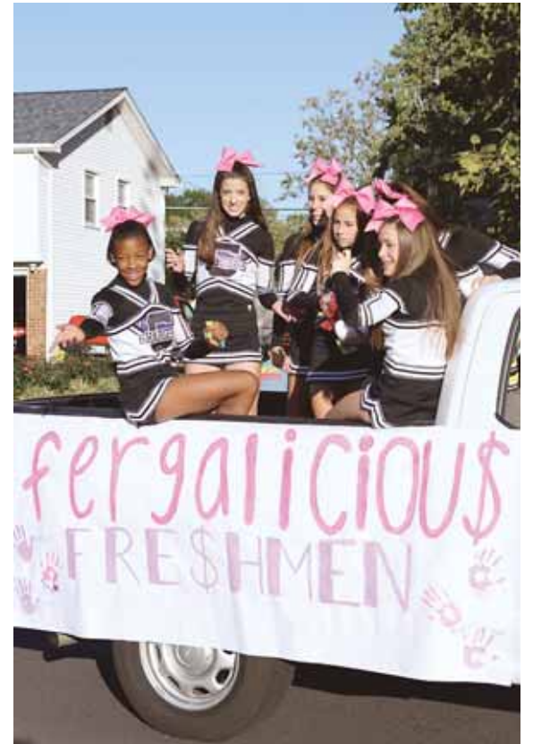
Freshman cheerleaders throw candy to children along the parade route.