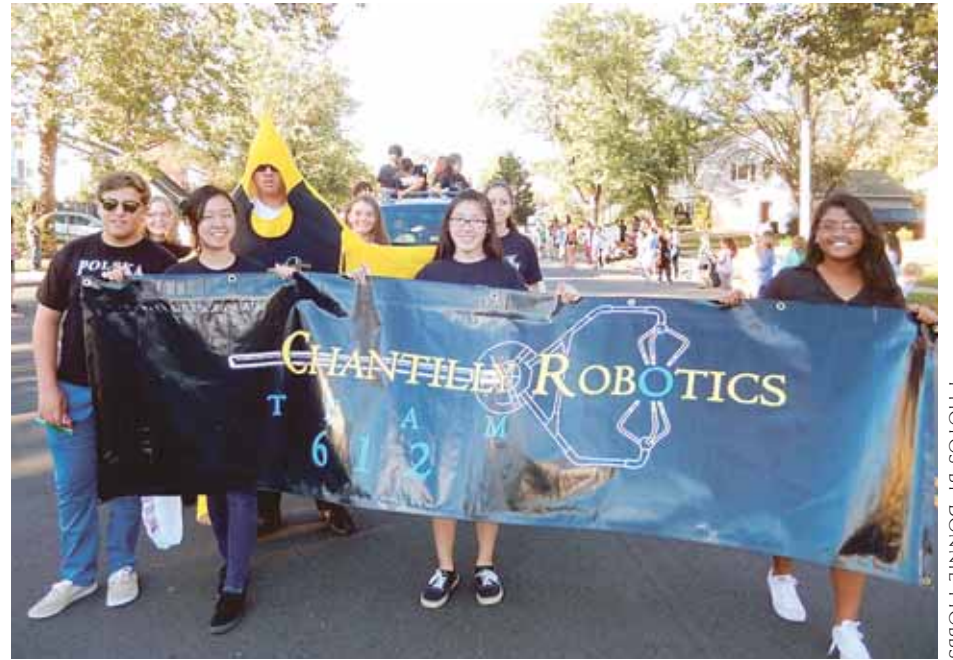
Chantilly High robotics students