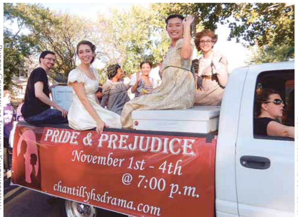
Cast members were in Chantilly's Homecoming Parade.