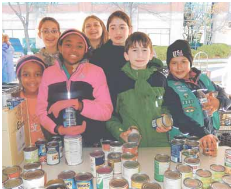
Sorting canned goods last year are members of Girl Scout Troop 3327 of West Ox Baptist Church in Chantilly.