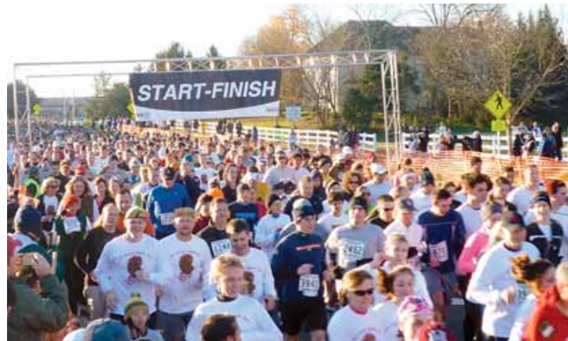
Thousands of people run and walk in the annual Virginia Run Turkey Trot.