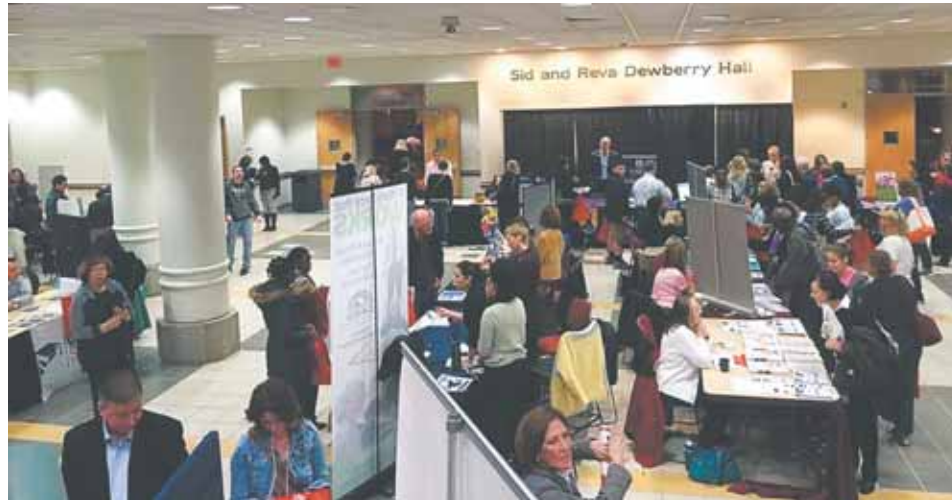
The resource fair booths from Future Quest at GMU in 2015.

Future Quest specifically targets students with any disability. They include the blind or visually impaired, deaf or hard of hearing, learning disabilities, orthopedic disabilities, intellectual disabilities, traumatic brain injuries, or other health impairments and emotional disabilities. Students who attend come from all over Northern Virginia, Maryland, the District, and West Virginia.