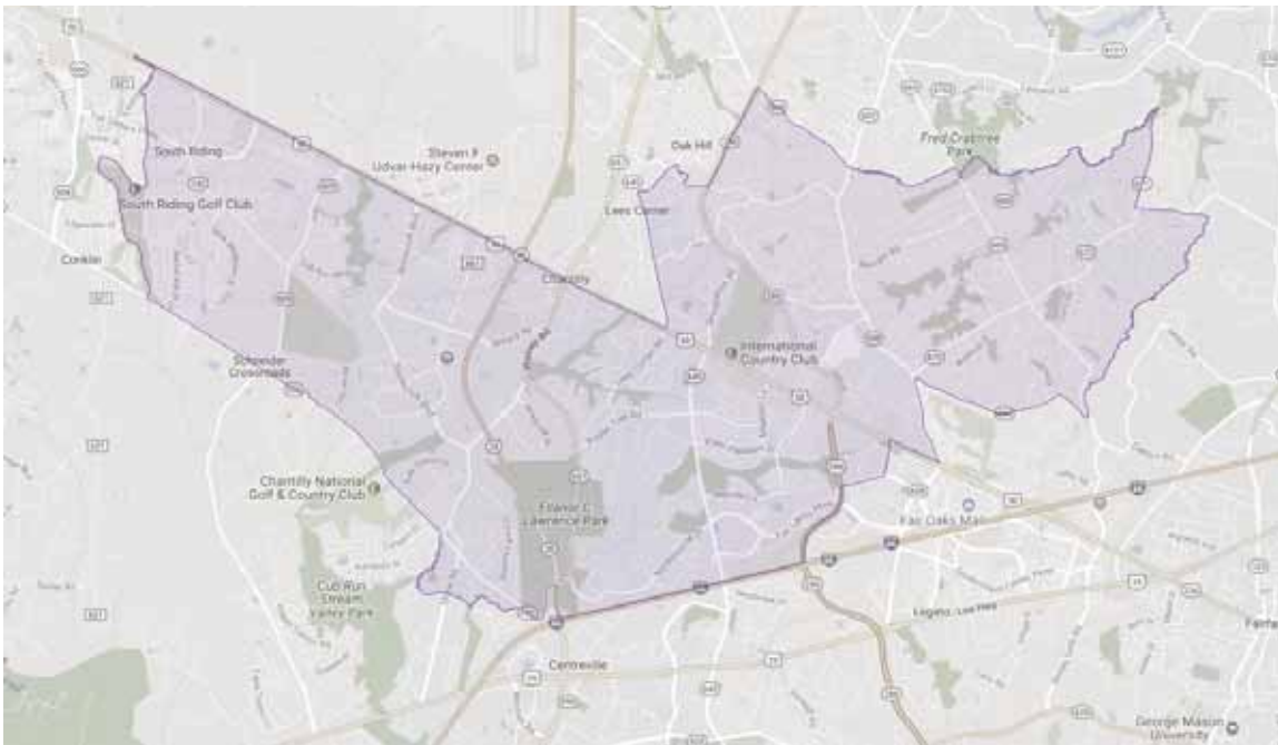
The 67th District stretches from South Riding through Sully Station and Penderwood.