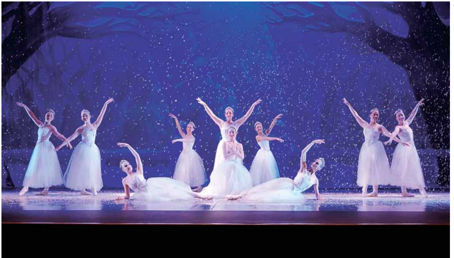
A winter wonderland of sparkling snowflakes in Fairfax Ballet's Nutcracker.

The Nutcracker. 2 and 7 p.m. in the Centreville High School Auditorium, 6001 Union Mill Road, Clifton. The entirely student and volunteer