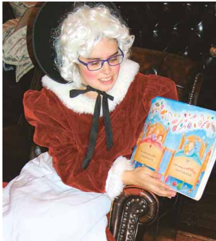
Mrs. Claus reads "The Night Before Christmas" to children during Breakfast With Santa at Maggiano's Little Italy in Springfield Town Center on Sunday, Nov. 26, 2017.