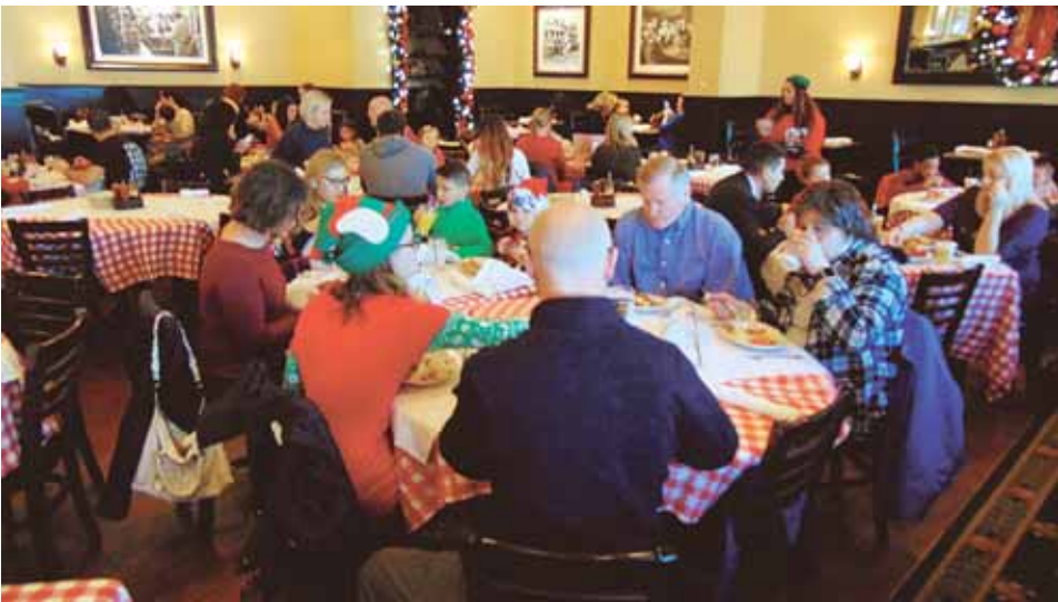
About 60 people attended Breakfast With Santa at Maggiano's Little Italy in Springfield Town Center.