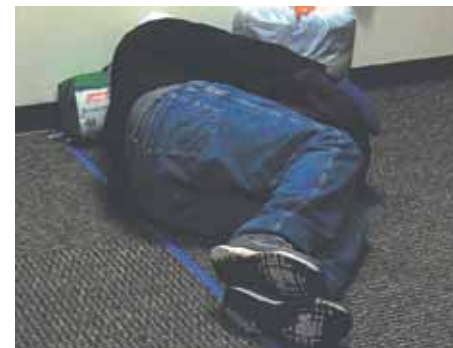
One of 50 homeless people who spent the night at Annandale United Methodist Church.