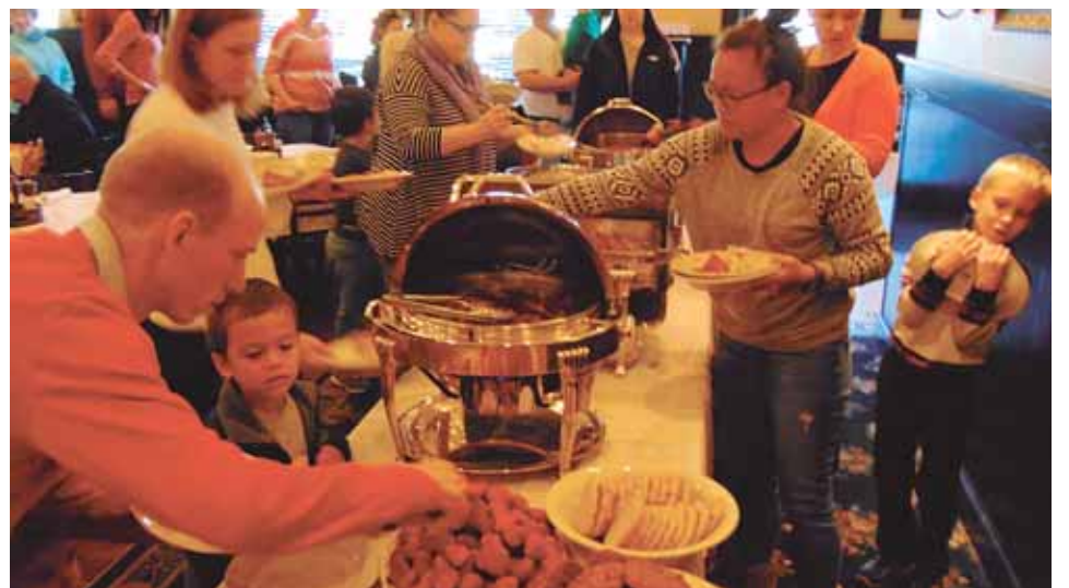
People help themselves to the Maggiano's breakfast buffet.