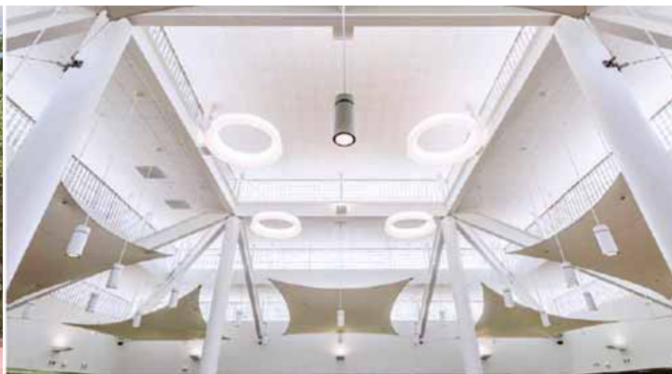
Outside (left) and inside (right) the renovated Tysons-Pimmit Regional Library.