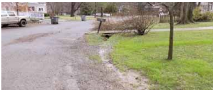
Franklin Park and Chesterbrook Neighborhood before (left) and after (right) Stormwater Improvement Project.