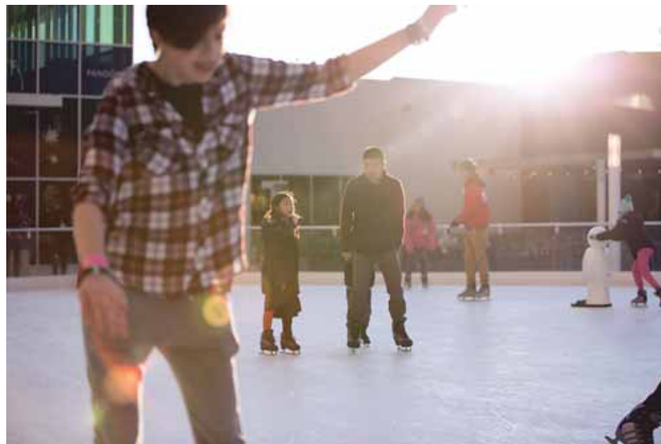
Skaters struggle for balance at the ice skating rink at Tysons Corner Center on Saturday, Dec. 16.