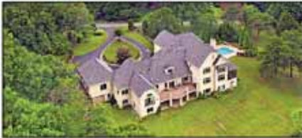
Clifton - $2,250,000

Hermendorfer Associates Top 1% of Agents Nationally