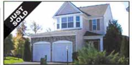
Gainesville - $465,000