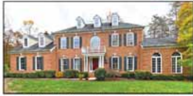
Clifton/Balmoral Forest - $965,000

Find More Information at: www.Hermendorfer.com • 703-503-1812