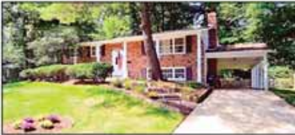
Fairfax - $589,900

Classic colonial style split foyer home in terrific location * Wood floors * 2 fireplaces * Updated kitchen that opens to screened porch & deck overlooking large, fenced back yard * 5 bedrms * 3 full baths * Huge walkout family rm. So convenient to transportation & commuter routes, shopping, schools & GMU.