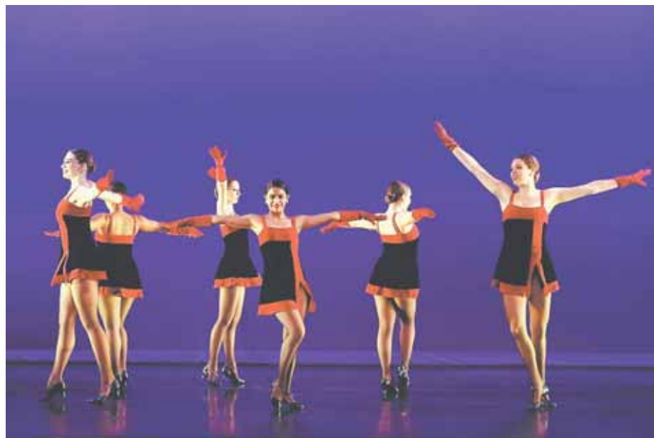
Encore Dance Company in performance.