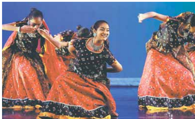
Nrityanjali Dance Company in performance.

This year the VADC will award two scholarships for talented dancers from a member company