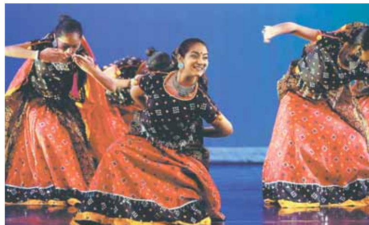
Nriyjanjali Dance Company in performance.

This year the VADC will award two scholarships for talented dancers from a member company