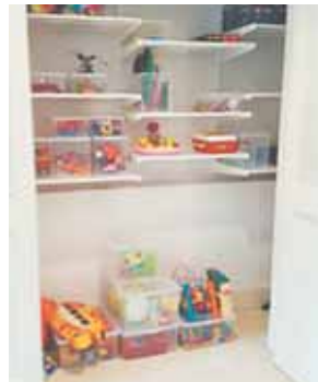
Teaching children to put away toys at the end of the day can create a peaceful environment.