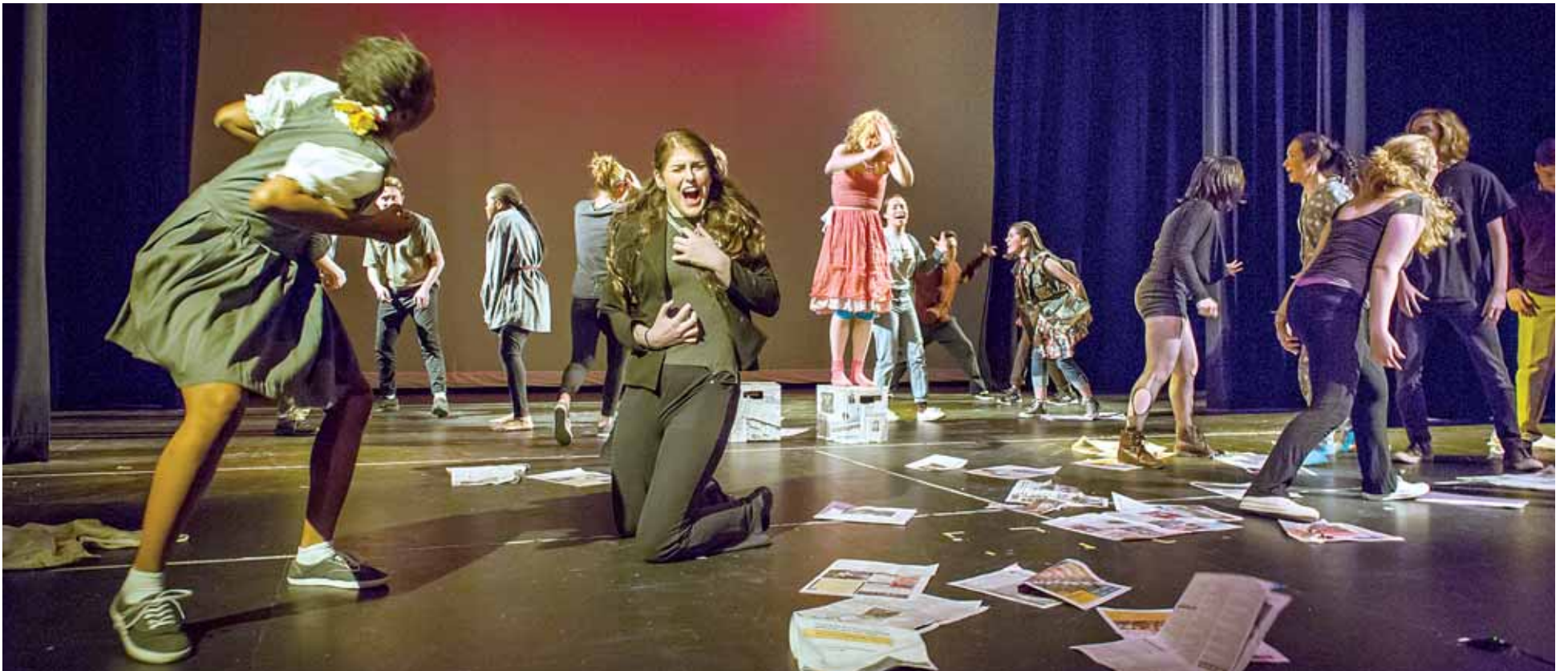
Yorktown Theatre is doing an encore performance of "Voices Out of Chaos" on Friday, Jan 19 at 7 p.m.