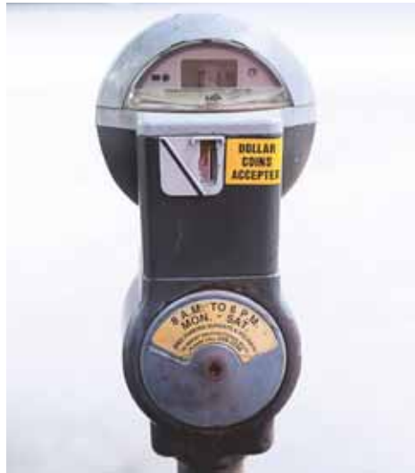
Parking meter in Clarendon with current parking hours listed.

"This is a good opportunity to look at on street parking across the county as a whole," said Caulkins. "There's about eight different categories for parking restrictions with hours all over the place. We need to think