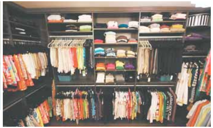
Small tasks such as putting away clothes each day can lead to a organized space.