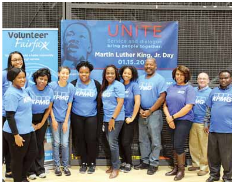
Volunteer Fairfax welcomed hundreds of volunteers who came ready to serve.

For more information about ways to serve the community, visit www.volunteerfairfax.org .