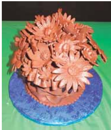
Flowers were sculpted out of chocolate for a previous Chocolate Challenge.

Vendors are: C & D Sweets, CakeLove, Cakes by Shelby, Cameron's Coffee & Chocolates, The Capital Candy Jar, Capitol Chocolate Fountains, Chocotenango, Confection Connection, Dave's Candy Kitchen, Diestro LLC, HB+M Chocolate, Le Papiyon Chocolatier, Marinucci's Gelato & Pastry, Mike's Fudge, Pacari Chocolate, Salazon Chocolate Co., Schokolat, Sugar Mama's Ice Cream and The Sweet Life Cakery.