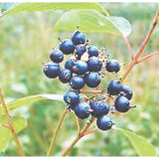
A shade tolerant Silky Dogwood produces blue or grayish berries in the fall and is considered a small tree, growing 6-10 feet in height. It is being offered as a bare root seedling by Northern Virginia Soil and Water Conservation District in their 2018 Native Seedling Sale.