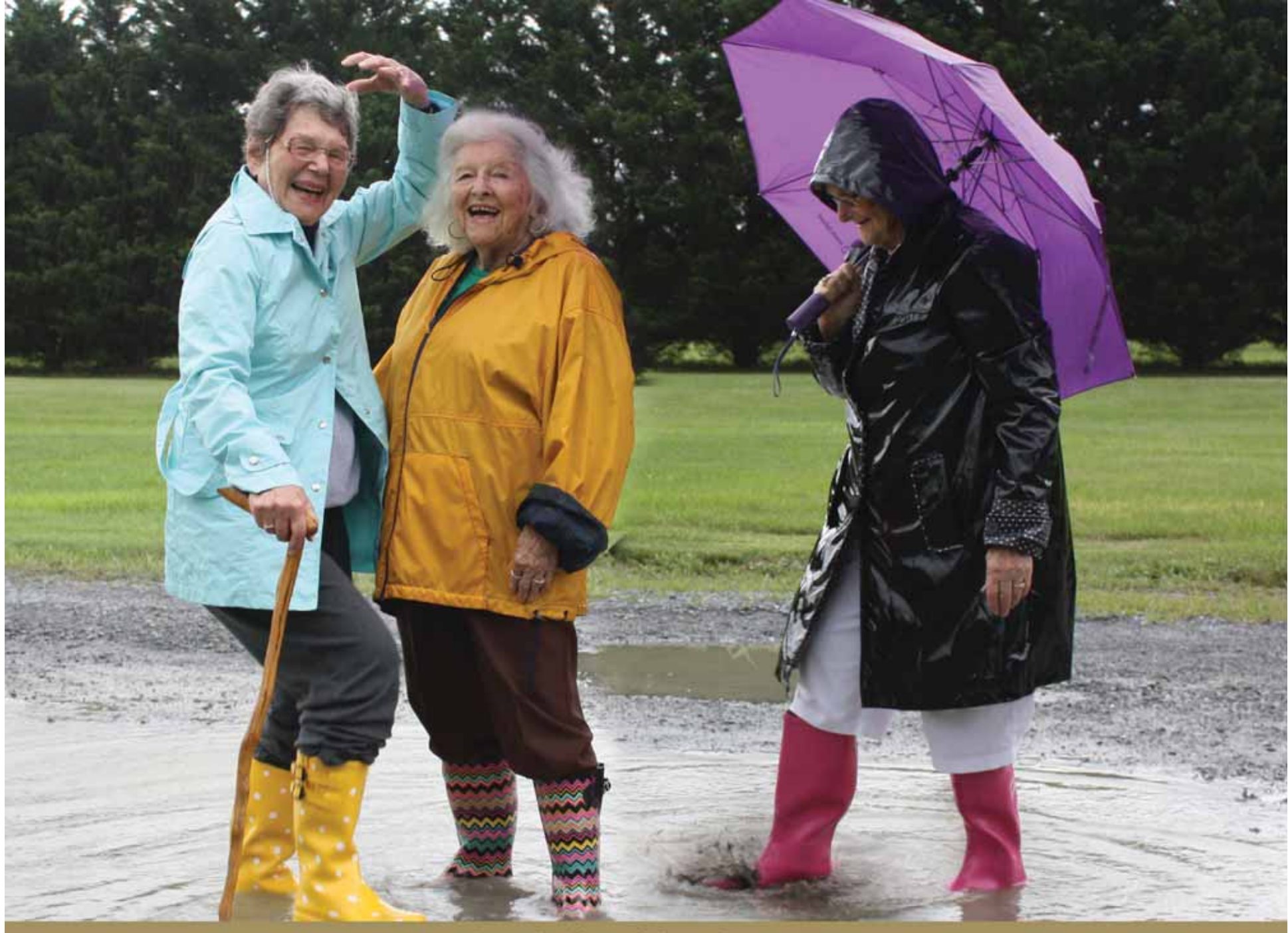
Brandywine residents since 2014