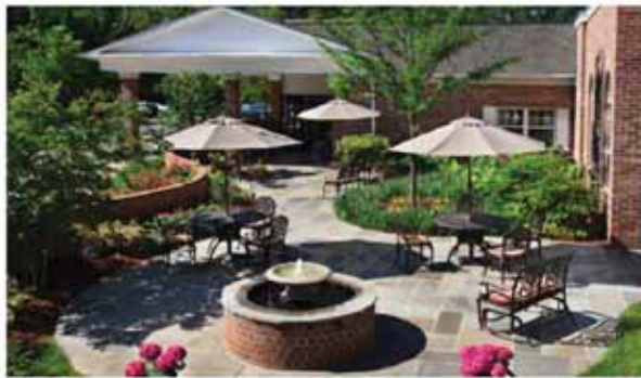
PAUL SPRING Alexandria • 703-768-0234 Serving residents since June 1988

To learn more about our communities visit our website at rui.net .