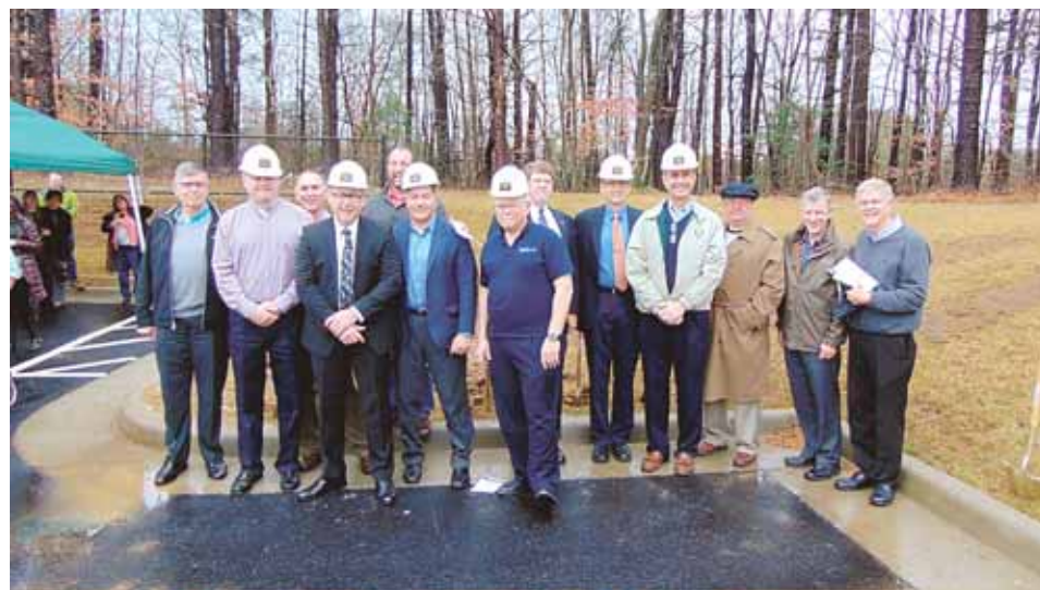
The current and past Elders at the Burke Community Church ground-breaking ceremony.