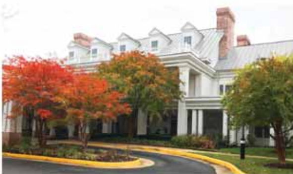
AARONDALE Springfield • 703-813-1800 Serving residents since May 1998