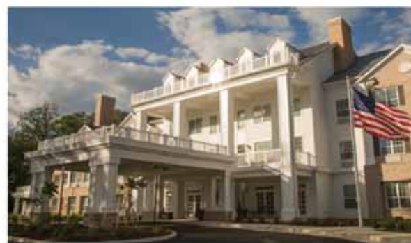
ASHLEIGH AT LANSDOWNE Leesburg • 703-345-6912 Opened in May 2017