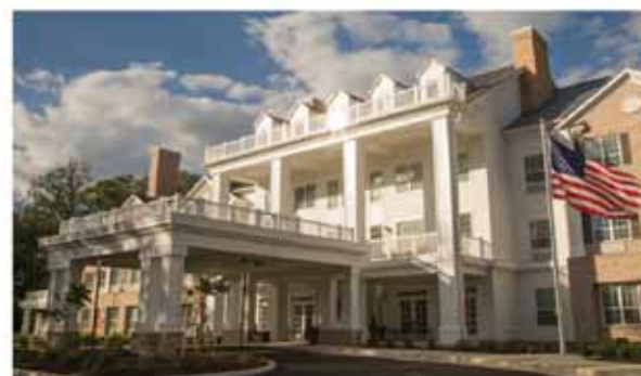
ASHLEIGH AT LANSDOWNE Leesburg • 703-345-6912 Opened in May 2017