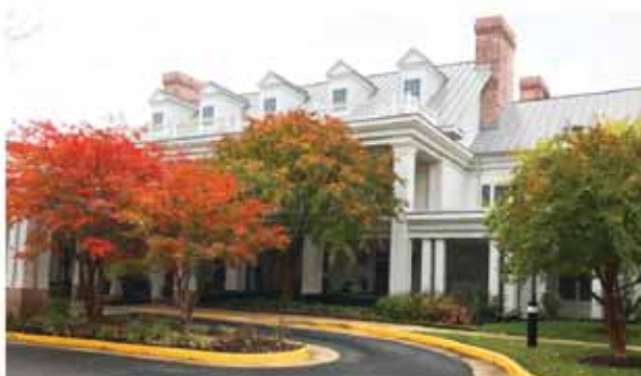
AARONDALE Springfield • 703-813-1800 Serving residents since May 1998