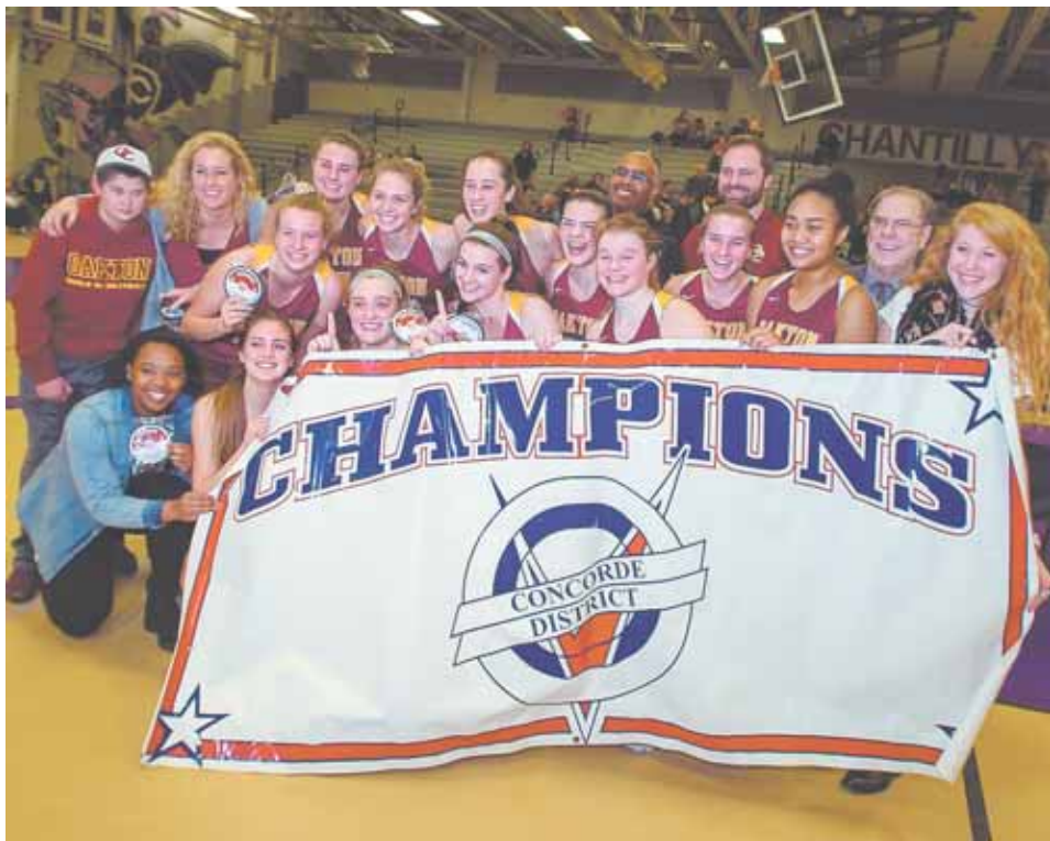
The Oakton Cougars defeated the Madison Warhawks 50-38 to earn the Concorde District Tournament Championship.