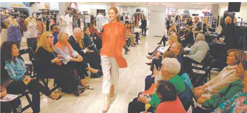
A professional model shows off the latest Spring fashions from Bloomingdale's during the New Dominion Women's Club Spring Fling Fashion Show on Sunday, March 18, 2018 at Bloomingdale's in Tysons Corner Center.