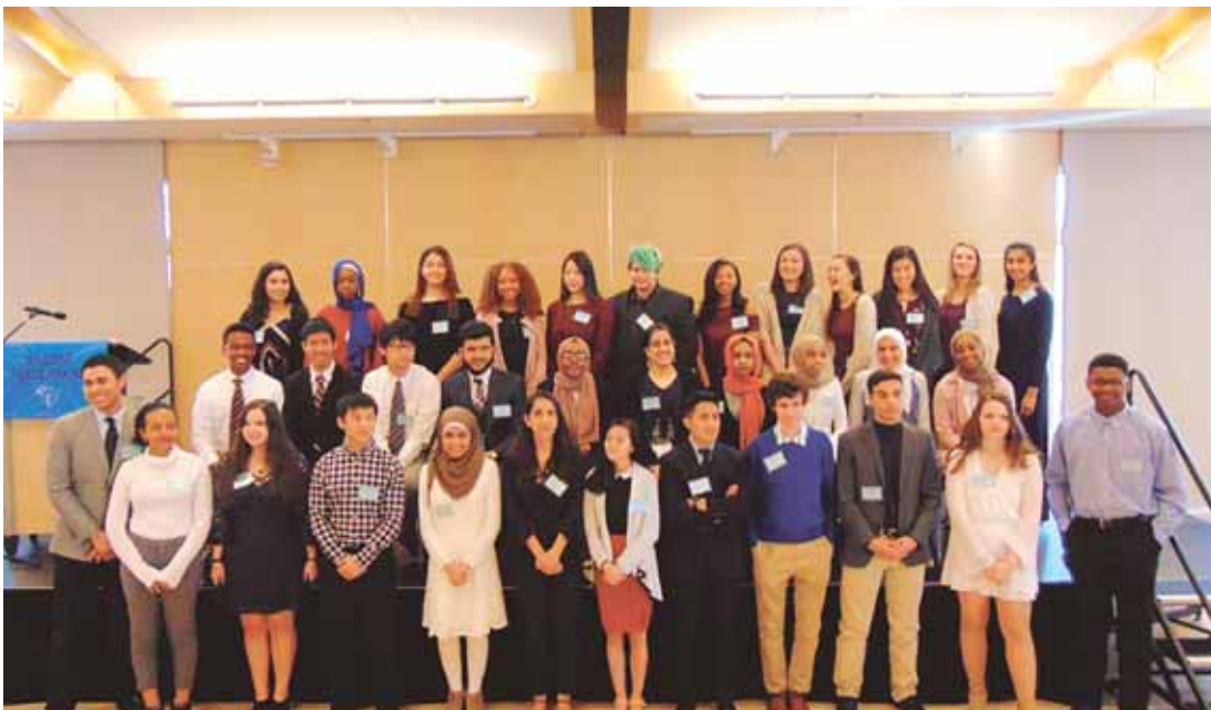
A group photo of the recipients of the 2018 Student Peace Awards from 23 Fairfax County schools.