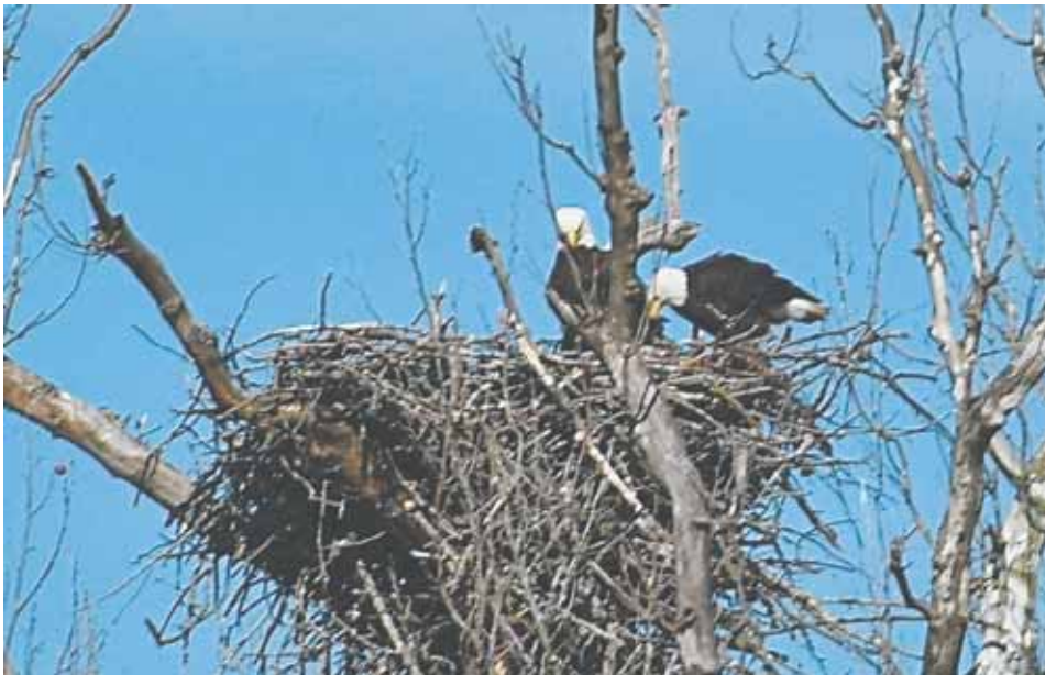
Two bald eagles tend to three eaglets near Great Falls. Bald eagles usually mate and lay eggs in mid-February. Eggs incubate just over a month — about 35 days — and the young fledge 10 to 12 weeks later.