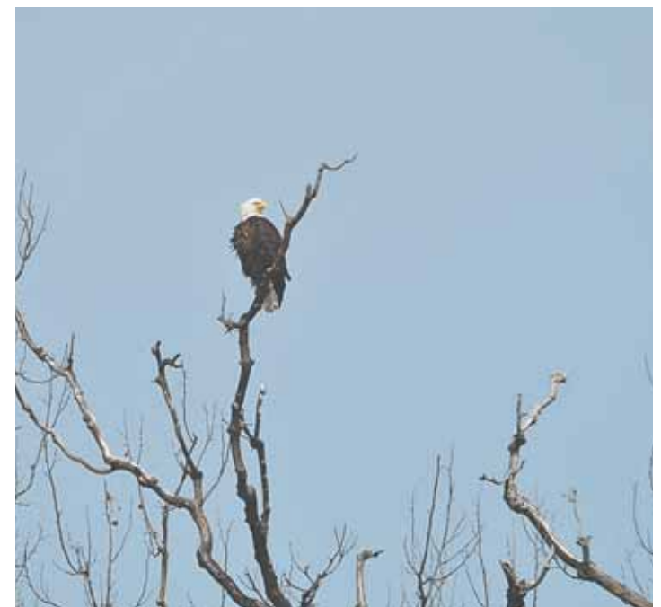
Majestic Bald eagle.

VIRGINIA BLUEBELL blooms are expected to peak the week of the Riverbend