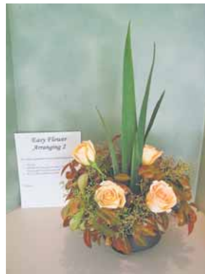
Easy Flower Arranging.

This garden contains a variety of lovely perennials, annuals and shrubs, and a growing display of native plants.