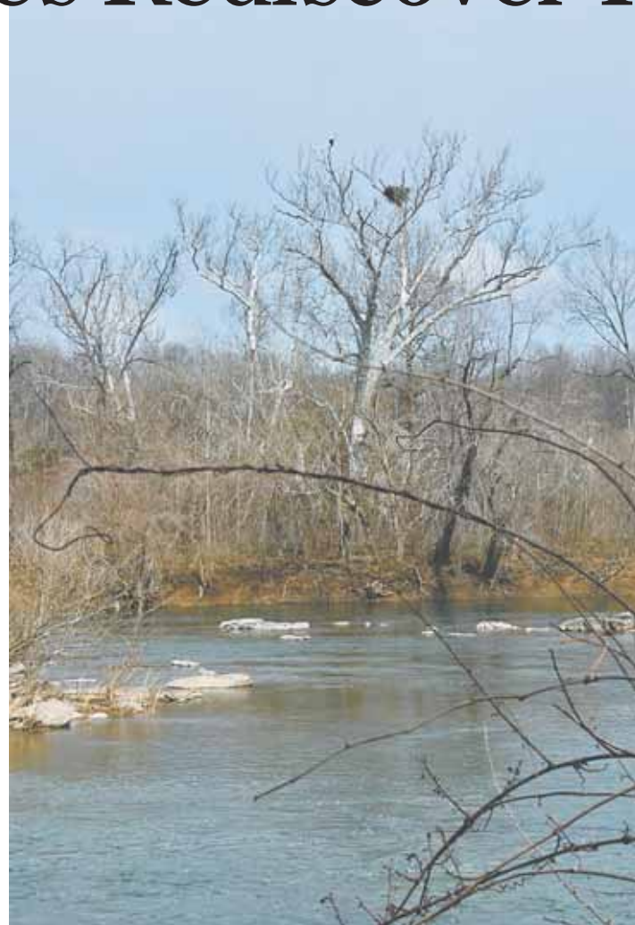
A break in foliage along Riverbend Park's Potomac Heritage Trail allows outdoor enthusiasts to view an eagle's nest on Minnehaha Island in the Potomac River. With binoculars, eaglets are frequently visible.

Pollution and lead, such as buckshot and fishing weights, threaten eagles scavenging