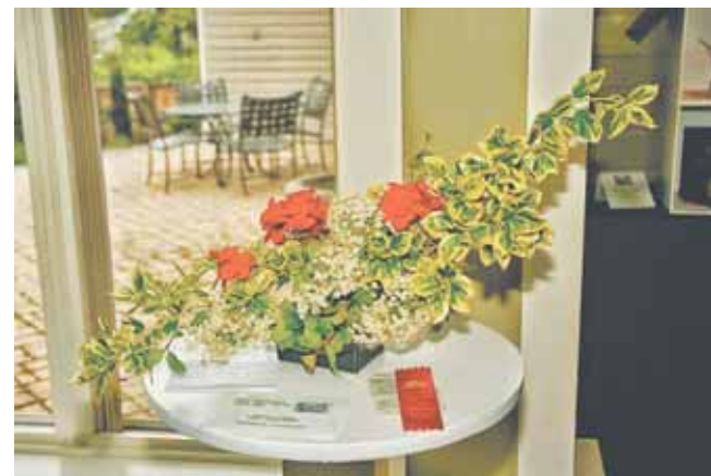
Ayr Hill Garden Club Flower Show will be held Sunday, April 29, 2-5 p.m. at 307 Windover Avenue, NW, Vienna.

❖ W&OD Trail Garden – Along the old W&OD railroad bed at Maple Avenue the club has created a pleasant urban space with seating and bicycle racks.