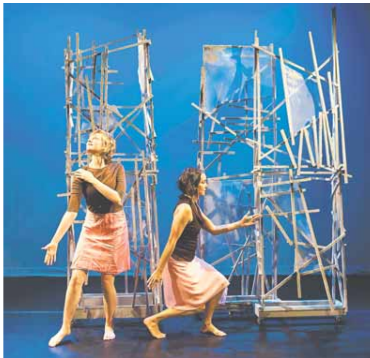
Dancers to perform "Border."

Earth Day Bird Walk. 8-9:30 a.m. at Gulf Branch Nature Center, 3608 N. Military Road. Celebrate Earth Day early with a day of birding. Begin with birding basics: using binoculars and field guides, identifying, and finding birds, then practice new