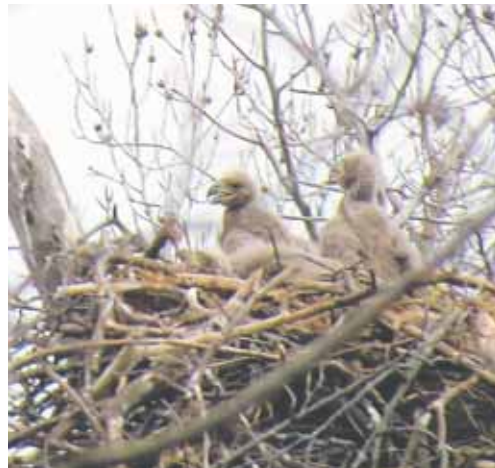
All three chicks wait for Dad to return with lunch. Photo taken from the Palisades Trail in Fort Bennett Park.

This includes the constant roar of traffic on the parkway and low-flying helicopter traffic along the Potomac River. Last year the eagles raised two chicks in the same nest while National Park Service arborists cut down ash trees with damage by the Emerald Ash Borer right next to them. The non-native, invasive emerald ash borer infests ash trees and is nearly 100 percent fatal to infested trees, the park service said. Parks are cutting down damaged ash trees that pose a threat to structures, trails, and roadways along the George Washington Parkway and other parks in the region. The massive nest sits between the northbound and southbound lanes of the George Washington Memorial Parkway at Spout Run, and