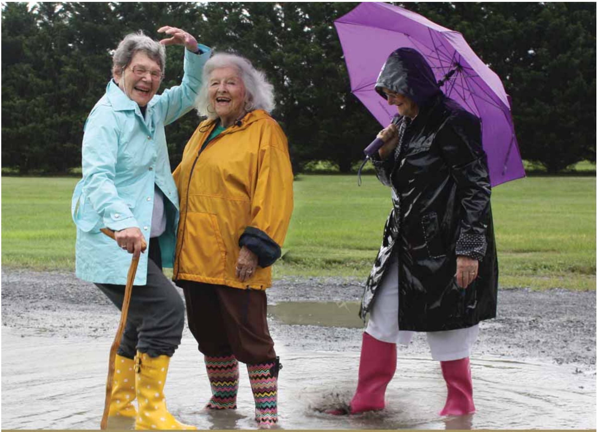
Brandywine residents since 2014