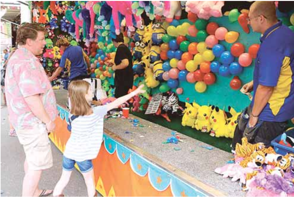
There will also be several free games and activities all over the park.