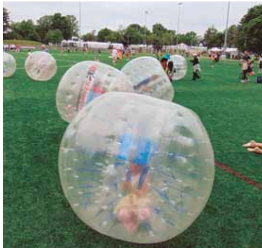
Children play Bubble Ball during McLean Day on Saturday, May 20, 2017, at Lewinsville Park in McLean.