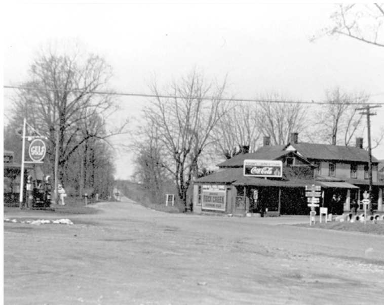
Tysons Corner, Route 7 and 123, looking south to Vienna. Circa, 1935.

For more information, visit: www.mcleancenter.org/special-events or call 703-790-0123, TTY: 711. The Center's telephone will be answered from 8 a.m. to 5 p.m. on the day of the festival.