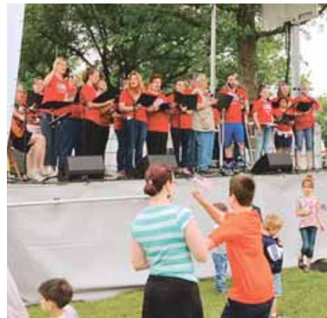
McLean Day now has two stages for entertainment—which means there is something for everyone to enjoy.

Nine Dranesville District 1A residents are running for seats on MCC's 2018-2019 Gov- www.ConnectionNewsletters.com