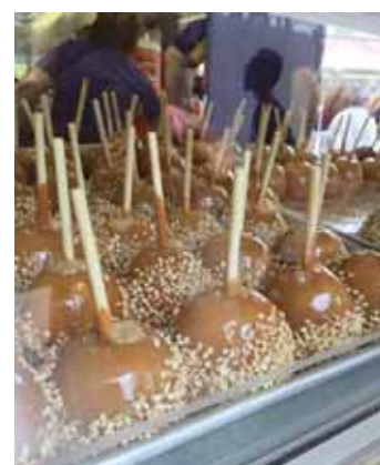
You might want to taste caramel apples.

There's lots of food options at McLean Day 2018