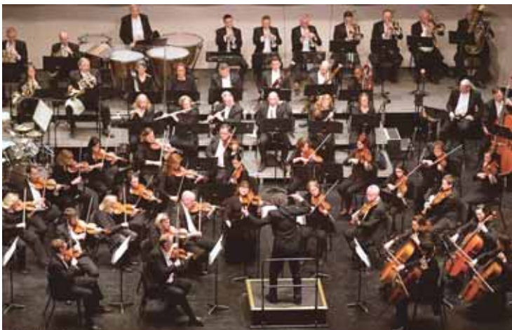
The Fairfax Symphony Orchestra in concert.

Farmers Market. 10 a.m.-2 p.m. at Springfield Town Center, 6699 Spring Mall Drive, Springfield. Visit