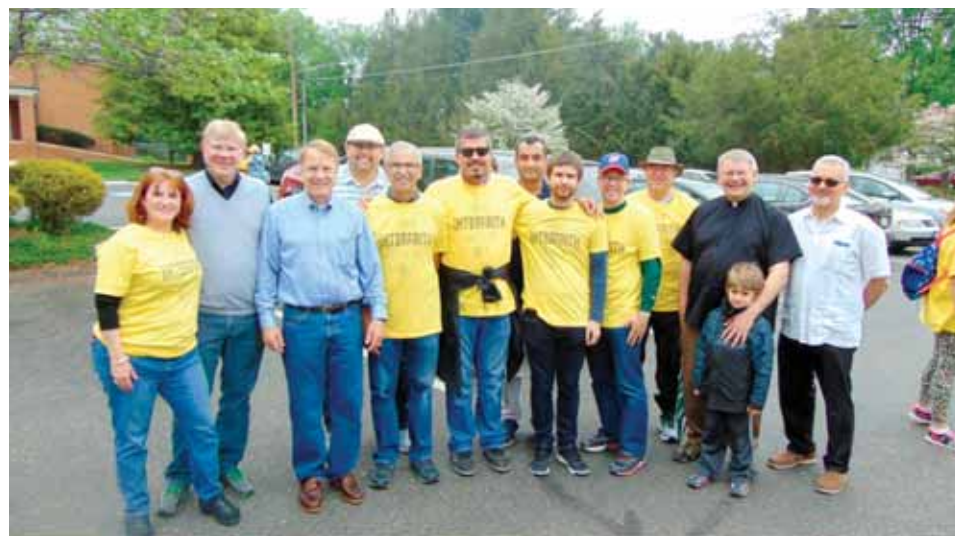
Pastors from various churches before the Fairfax Interfaith Friendship Walk at the parking lot of Fairfax United Methodist Church in the City of Fairfax.