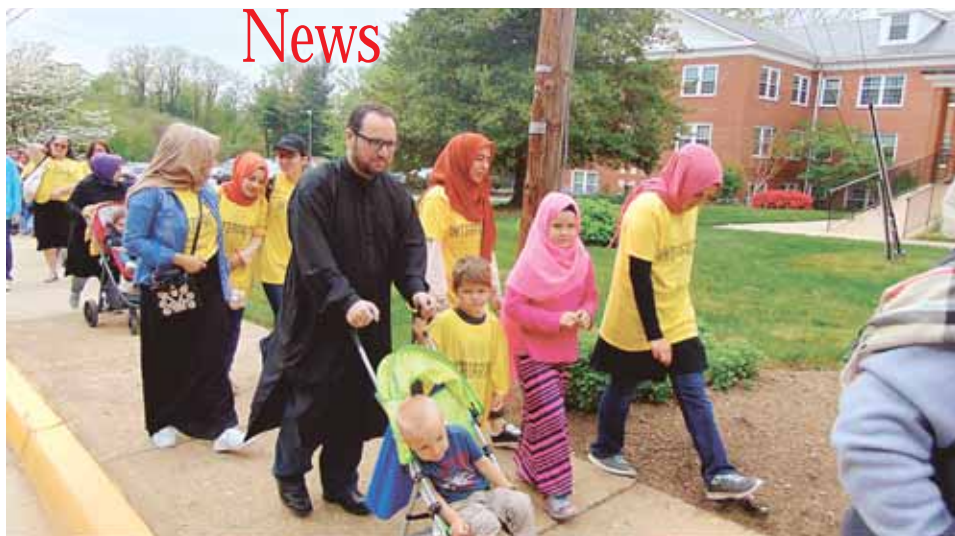
Walkers of all different faiths take part in the Fairfax Interfaith Friendship Walk on Sunday, May 6, 2018, which began at Fairfax United Methodist Church in the City of Fairfax.