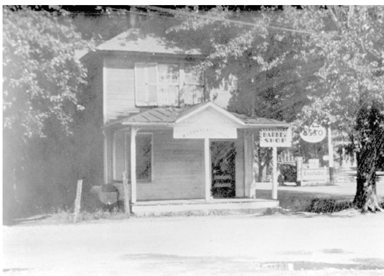
A.L. Stocks' Beauty - Barber Shop, corner of Elm St. and Chain Bridge Rd.