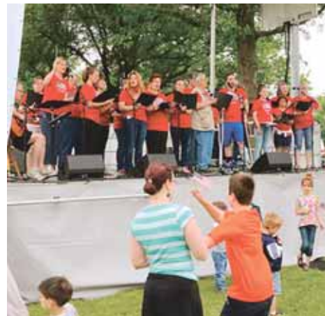
McLean Day now has two stages for entertainment—which means there is something for everyone to enjoy.

Nine Dranesville District 1A residents are running for seats on MCC's 2018-2019 Gov- www.ConnectionNewsletters.com