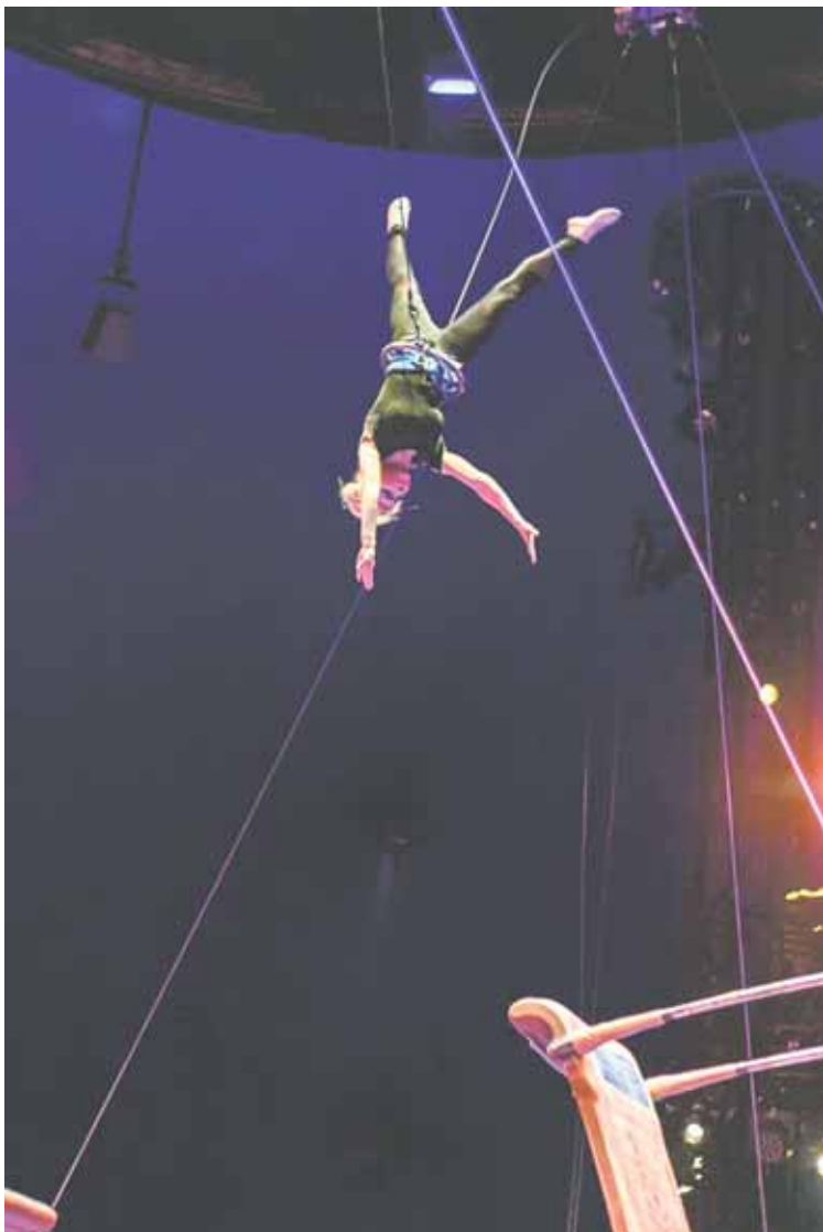
One of the acrobats practicing her jump from swing to swing. During practice the performers wear safety harnesses to ensure nothing happens.