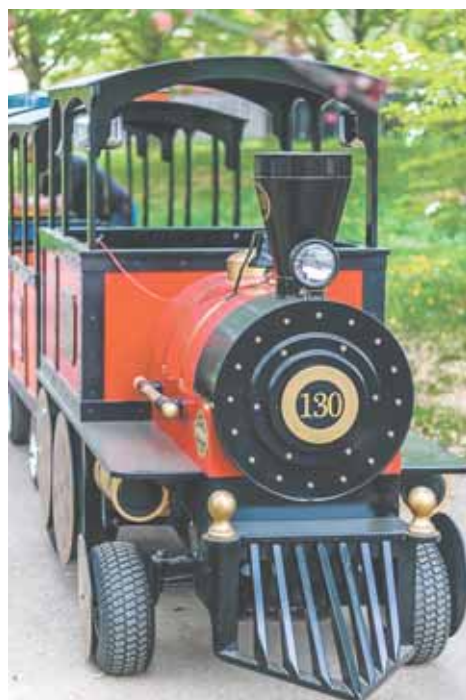
The new train at the park ready for its first ride of the 2018 season.