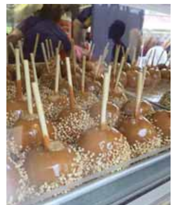
You might want to taste caramel apples.

There's lots of food options at McLean Day 2018