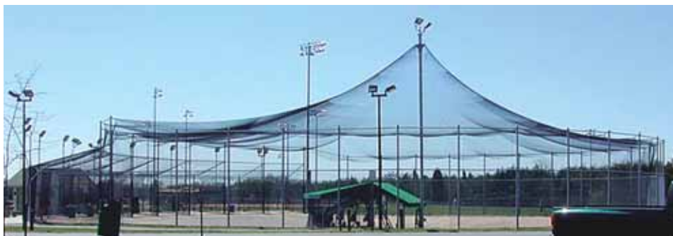
The Dugout batting cages at Braddock Park.

“We have paid FCPA hundreds of thousands of dollars in rent, but more importantly, provided a recreational facility which FCPA was unable to provide,” he said in a release.