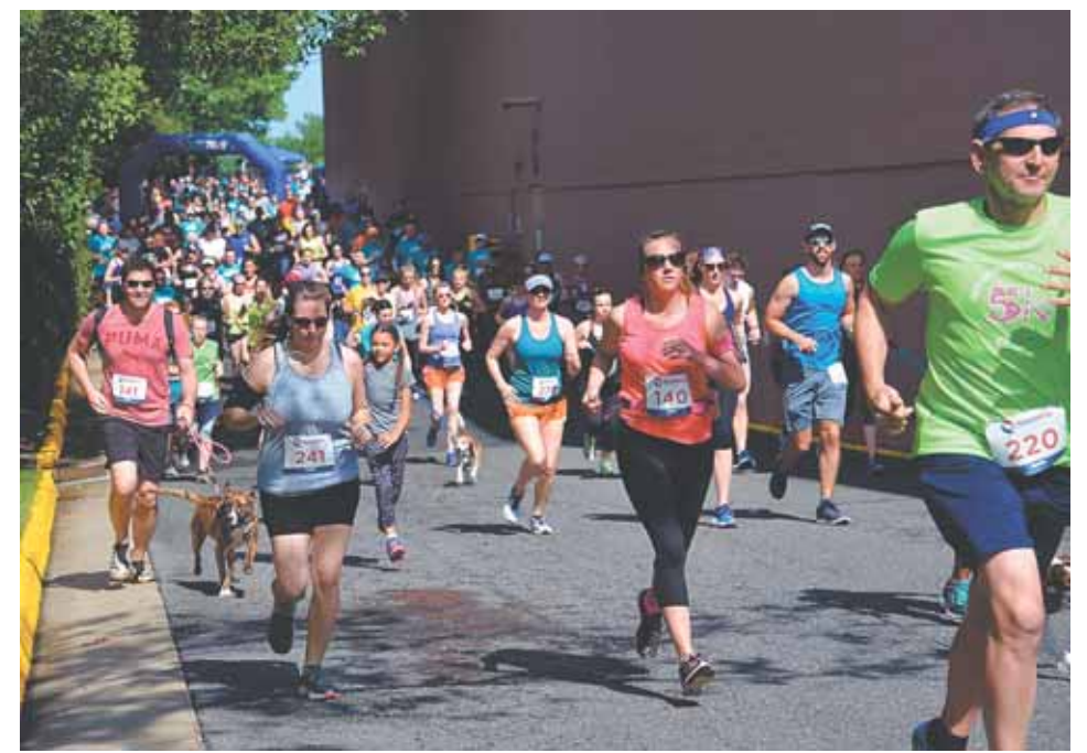
And they're off! Two and four-legged race contestants start the 5k Pups and Pints race to benefit HART – the Homeless Animal Rescue Team – and continue caring for and re-homing dogs and cats.