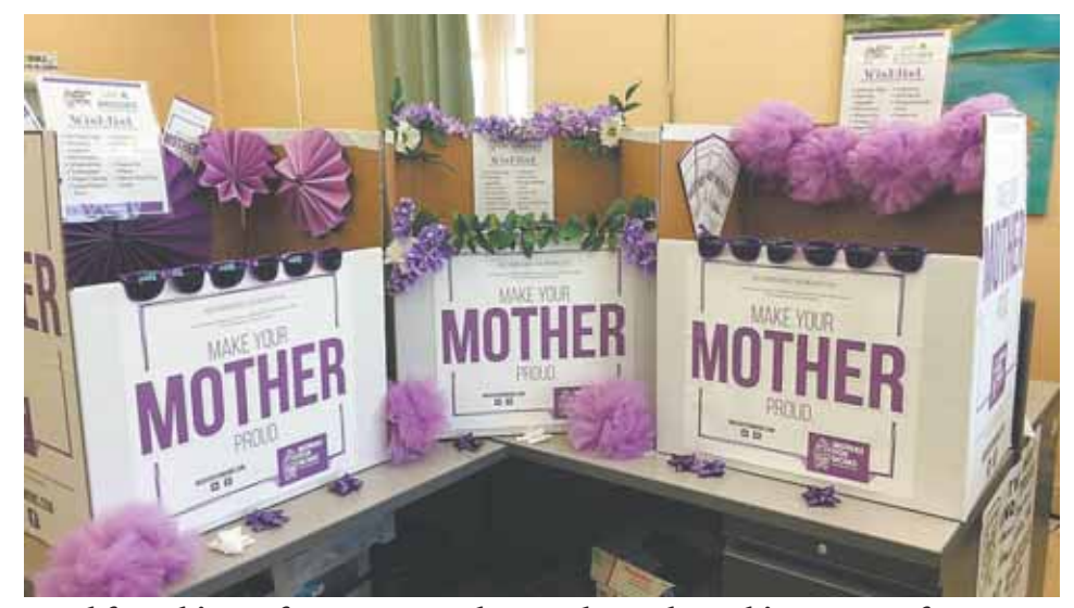
Local franchises of Two Men and a Truck conducted its Movers for Moms campaign to collect donations for mothers living in shelters.

On the other side of the equation, Two Men and a Truck also partners with local homeless shelters, where the donations will ultimately go. For the campaign, they ask for everyday items — the things so many people take for granted.