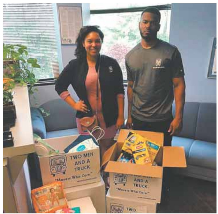
The nonprofit FACETS received donation from the Movers for Moms campaign.