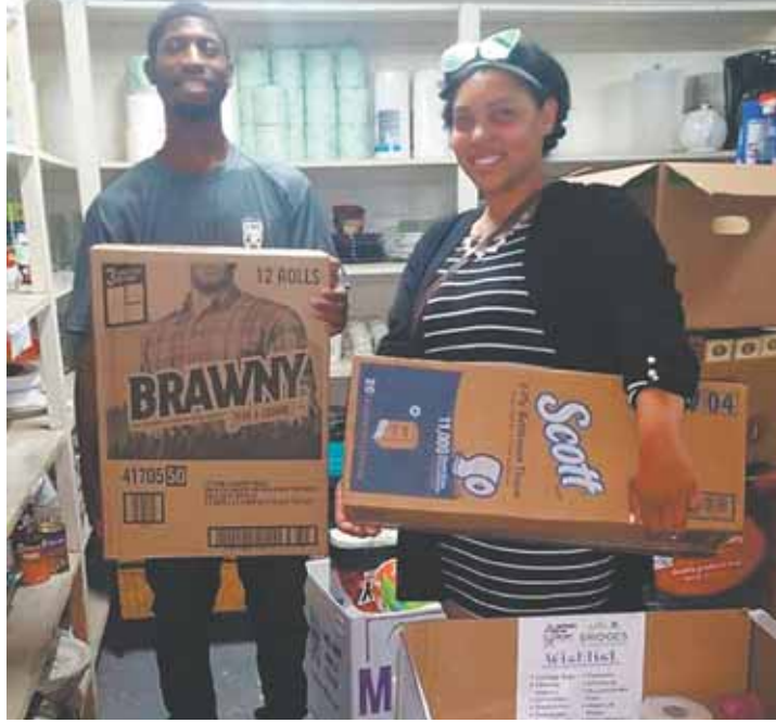
The nonprofit Bridges to Independence in Arlington received donations from the Movers for Moms campaign.

As part of this movement to honor mothers, Two Men and a Truck partners with businesses that then become designated donation drop-off locations. This year, there were 19 of these spots around the area.