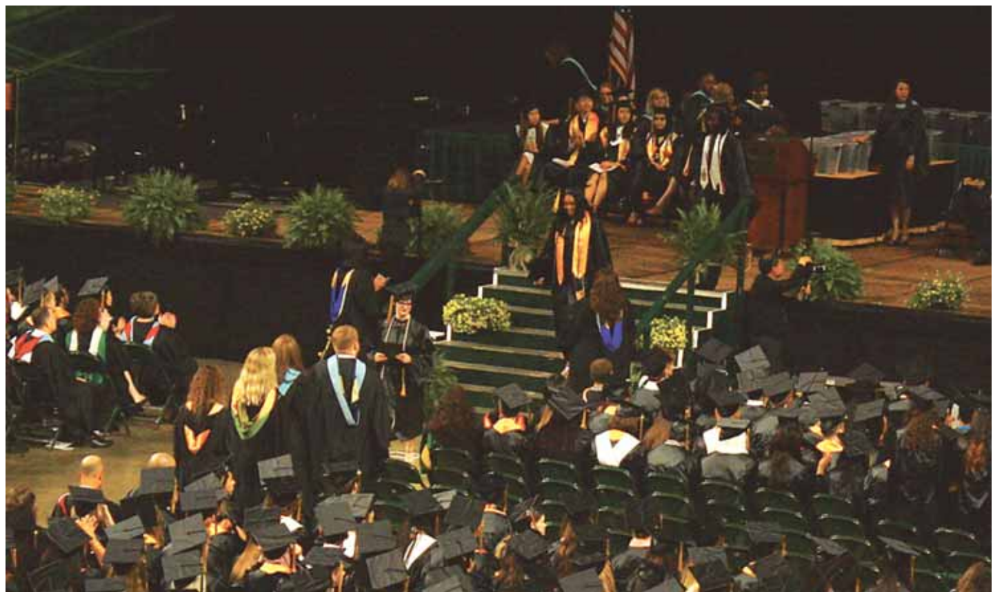
One by one, the graduates accepted their diplomas and crossed the stage.