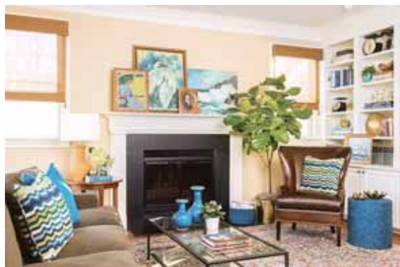
Adding throw pillows in light, airy colors like the one in the room by Annie Elliott Interiors, can make a space appear ready for summer.