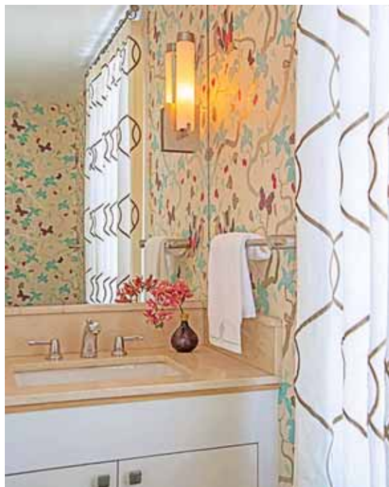
Adding new towels and shower curtain in light and airy colors, like those in the bathroom by Annie Elliott Interiors, can add a touch of summer to a bathroom.