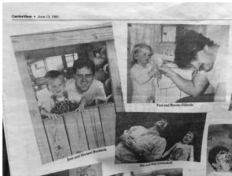
When I was four years old (June 13, 1991) I was in the Centre View with my Dad for the Father's Day photo. I was blow drying my Dad's hair.