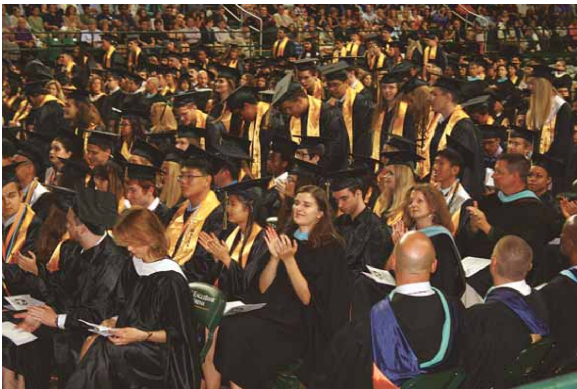
Graduates wore a sash indicating honor students.