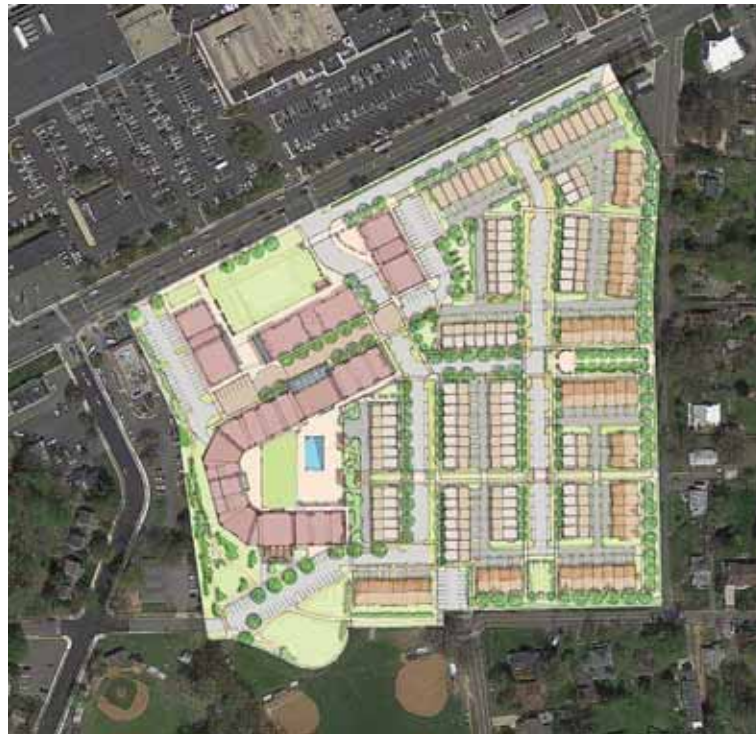
IDI wants to build 131 townhouses, 164 condos and 20,000 square feet of retail, plus have 24,000 square feet of commercial/community uses on the Paul VI property.