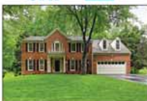
Fairfax Station • $830,000 UNDER CONTRACT IN 1 DAY!