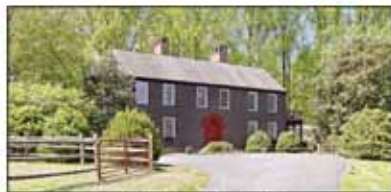
Clifton - $995,000

Find More Information at: www.Hermendorfer.com • 703-503-1812