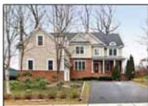
Annandale • Over 5,000 sq/ft. $899,000