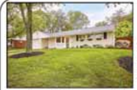
Springfield Crestwood $589,000

Jim Fox 703.503.1800 jim.fox@LNF.com Washingtonian Magazine's "Top Team" 2015 NVAR Lifetime Top Producer