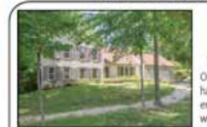
Ridges of Glendilough $719,900 Newly Listed!