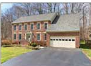
Fairfax Station • $800,000 SOLD IN 16 DAYS!