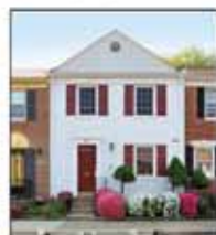
Springfield • $379,900 UNDER CONTRACT IN 1 DAY!