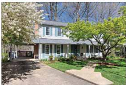
Burke • Burke Station Square • $619,000

If you are thinking of buying or selling this spring, now is the time to give us a call!