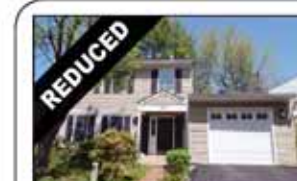
Burke Beauty $515,000 Charming Single Family Home