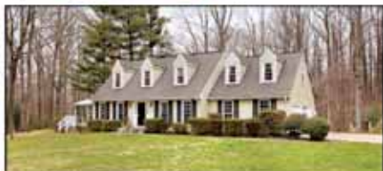
Clifton - $699,000

Hermendorfer Associates Top 1% of Agents Nationally