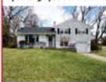
6207 Kentland Street Listed at $429,900 LONG & FOSTER

Under Contract in Springfield Sparkling Split Level Home