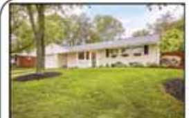
Springfield Crestwood $589,000

Jim Fox 703.503.1800 jim.fox@LNF.com Washingtonian Magazine's "Top Team" 2015 NVAR Lifetime Top Producer