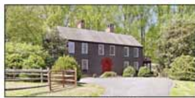
Clifton - $995,000

Find More Information at: www.Hermendorfer.com • 703-503-1812