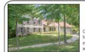
Ridges of Glendilough $719,900 Newly Listed!