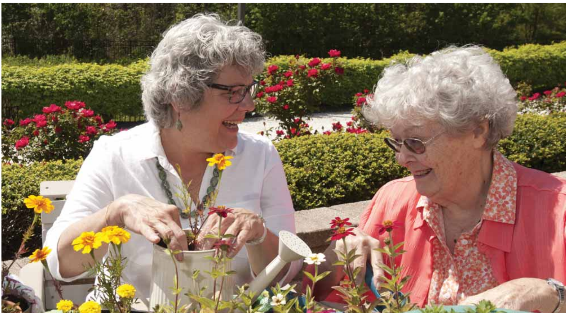
Brandywine resident since 2013