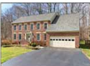
Fairfax Station • $800,000 SOLD IN 16 DAYS!