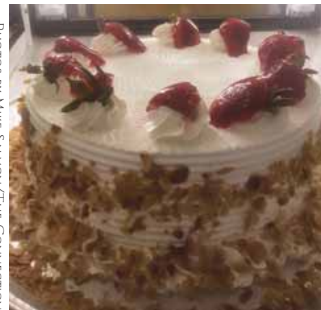
Cakes are popular at the café, and can be special ordered for any occasion.