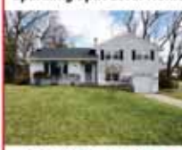
6207 Kentland Street Listed at $429,900 LONG & FOSTER REAL ESTATE

Under Contract in Springfield Sparkling Split Level Home